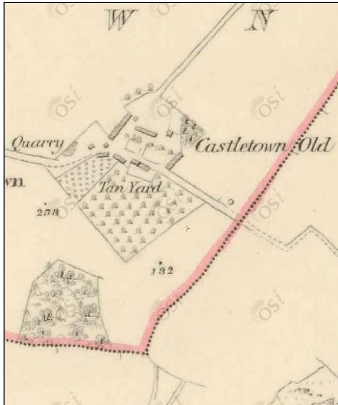
1 st edition OS map c. 1830 ( www.osi.ie )