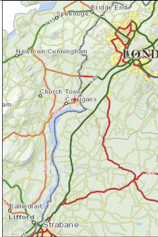
Location Map ( www.archaeology.ie )