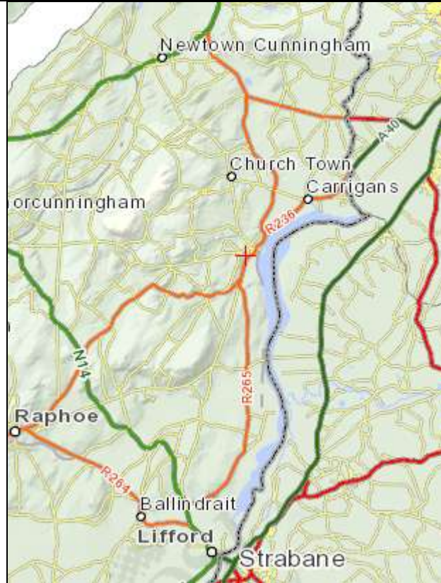
Location Map ( www.archaeology.ie )