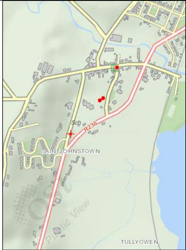
Location Map – close up