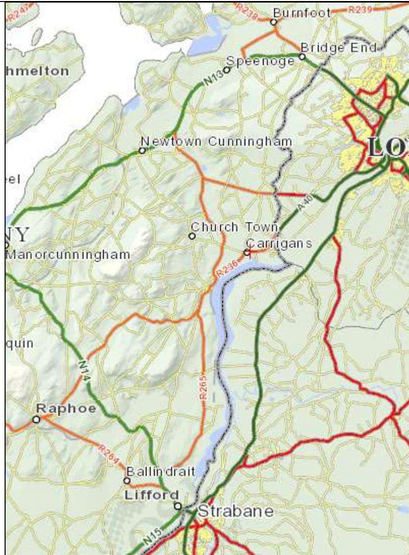
Location Map ( www.archaeology.ie )