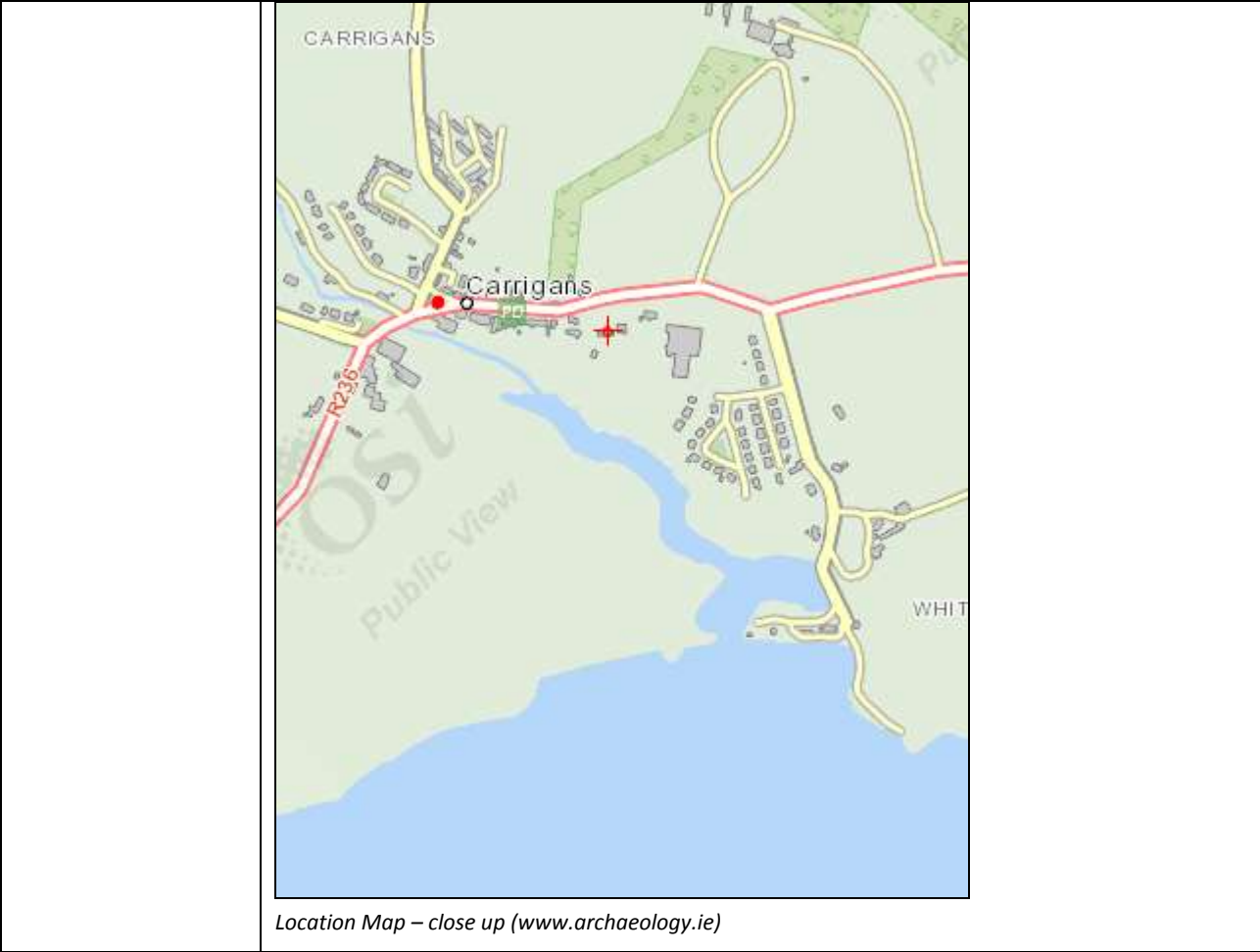
Location Map – close up