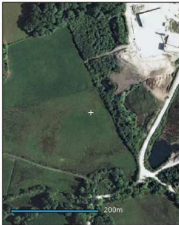
Present-day aerial view extract