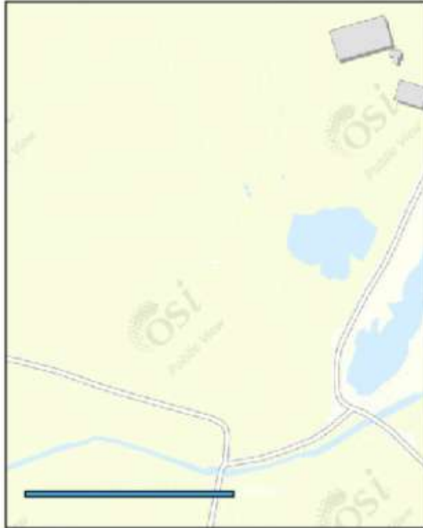
Present-day mapping extract ( www.osi.ie )