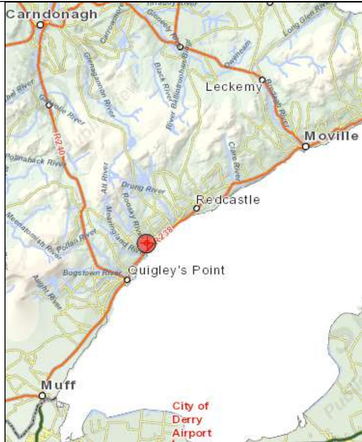
Location Map ( www.archaeology.ie )