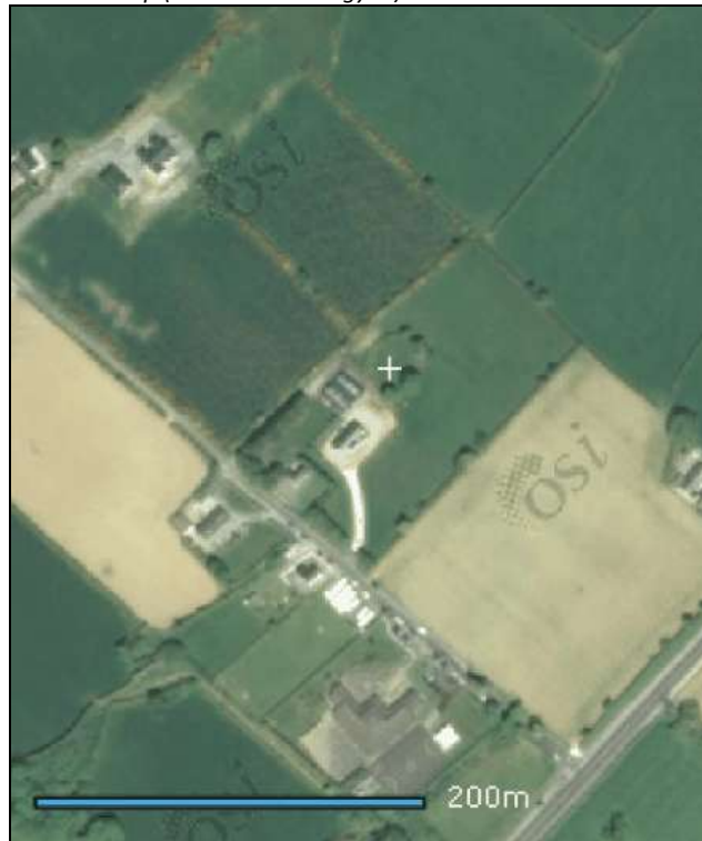
Location Map – close up