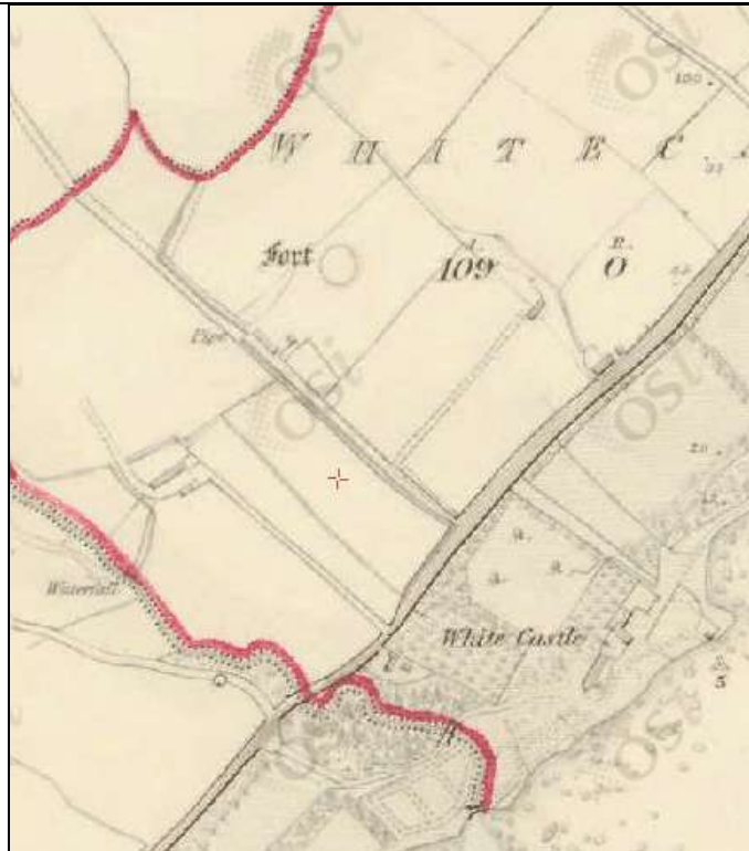
1 st edition OS map c. 1830 ( www.osi.ie )