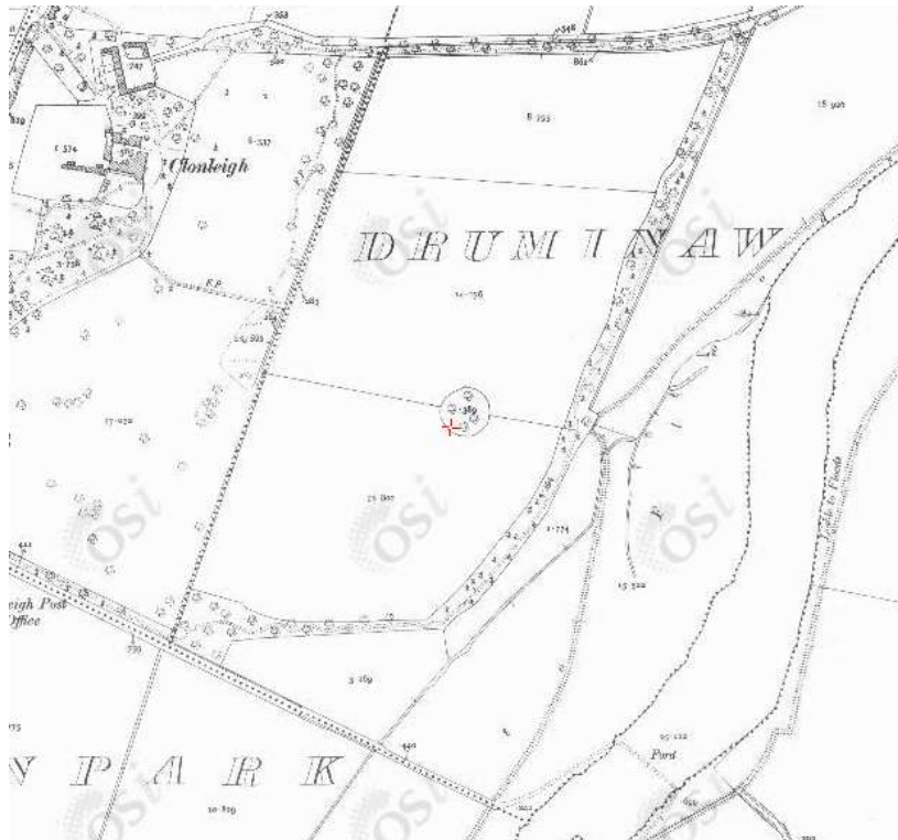
Extract from 2 nd OS map (1890s - 1900s)