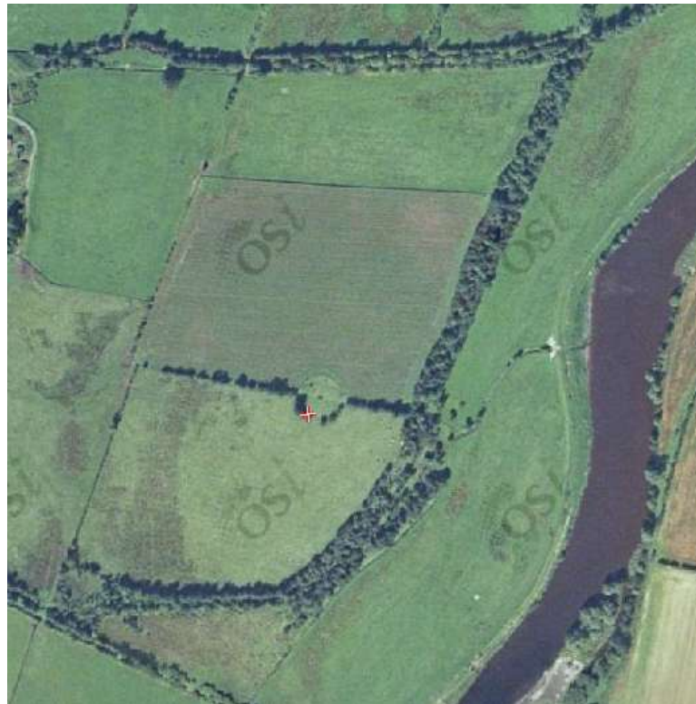
Present-day aerial view extract