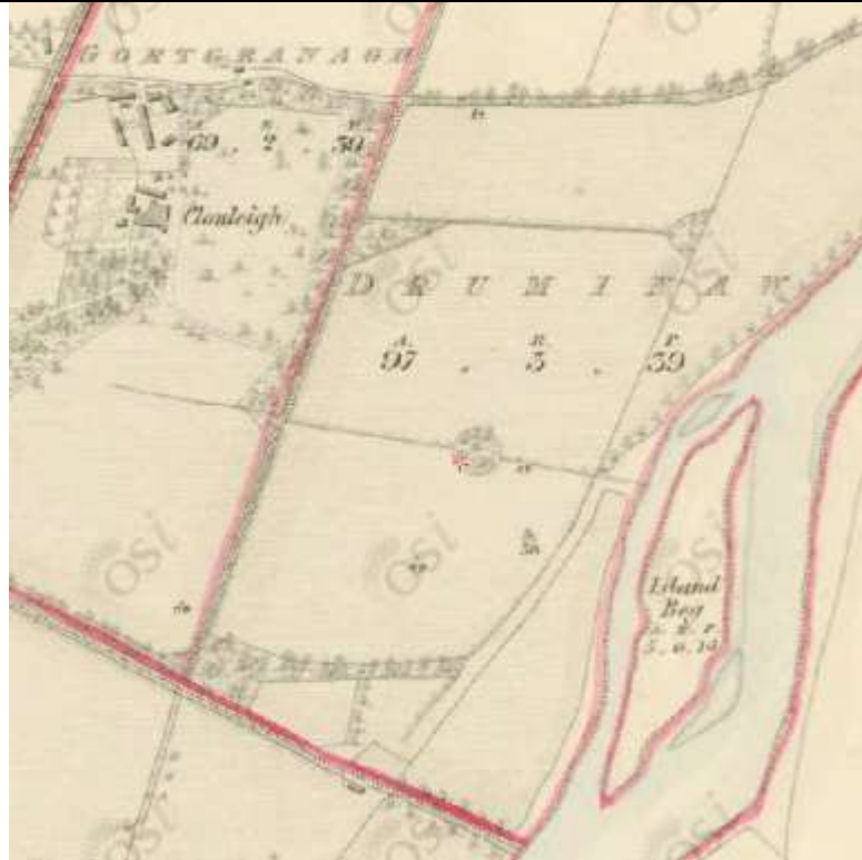
Extract from 1 st edition OS map (1820-1840)