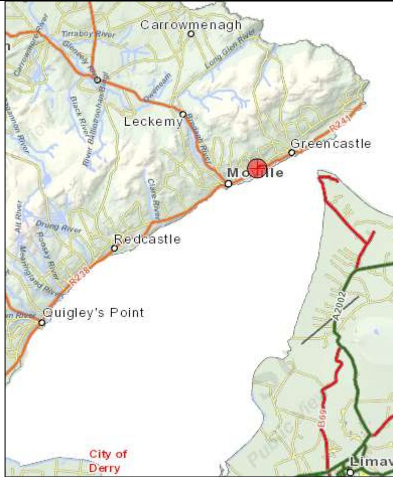
Location Map ( www.archaeology.ie )