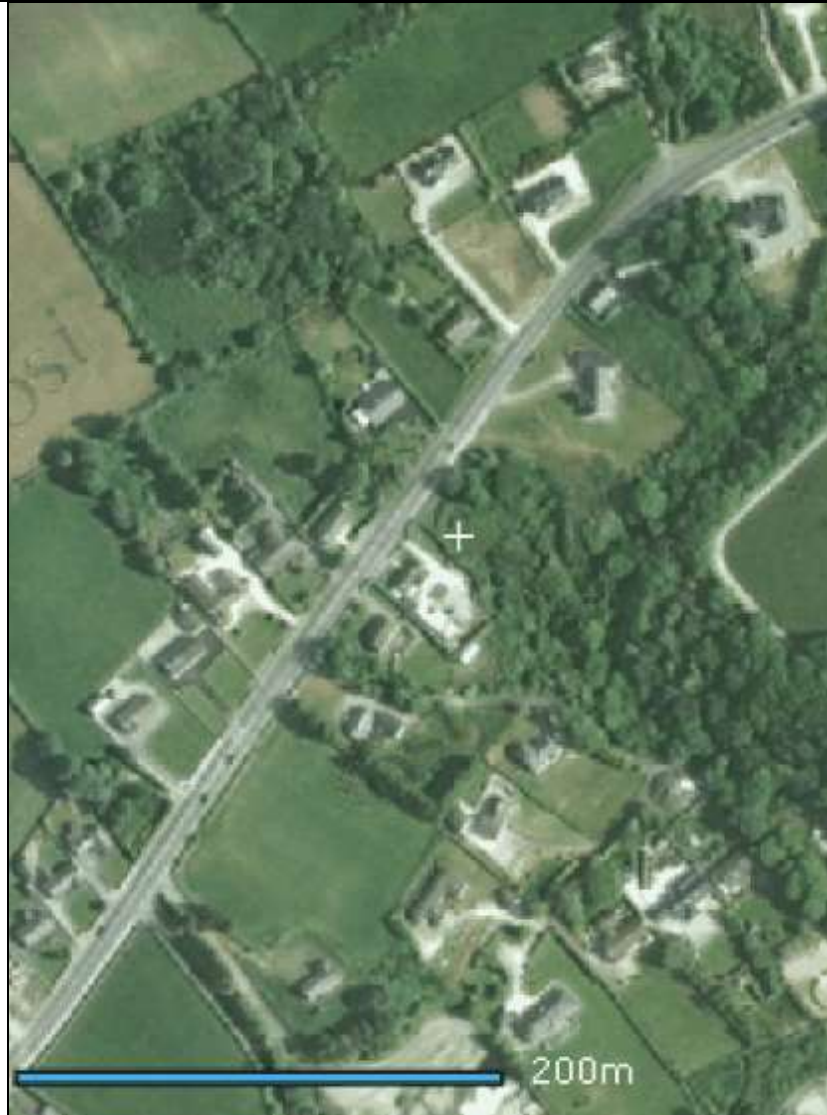
Location Map – close up