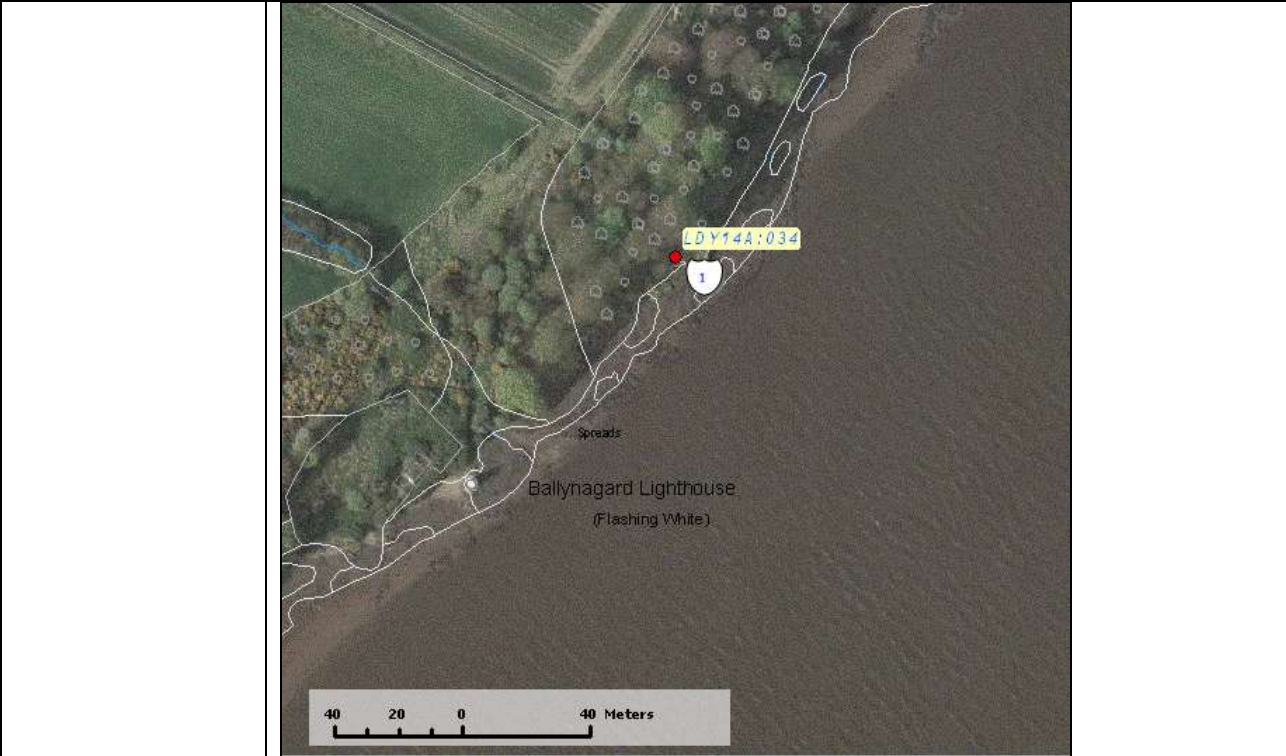
Extract from NIEA SMR MapViewer of the site