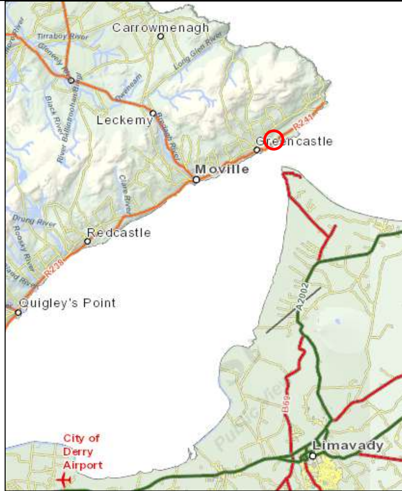
Location Map ( www.archaeology.ie )