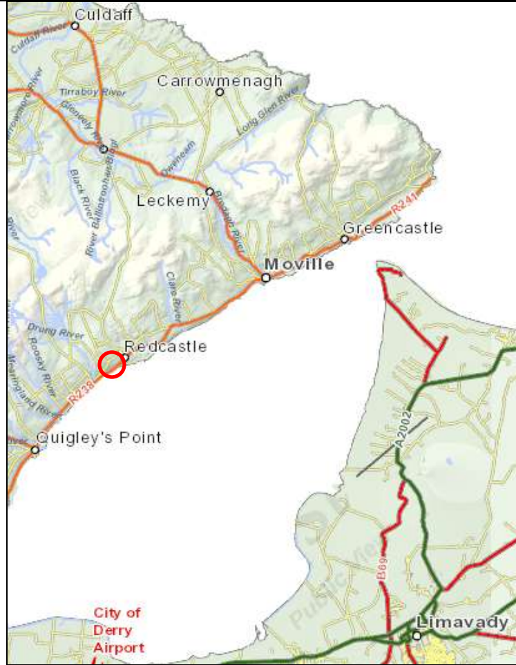
Location Map ( www.archaeology.ie )