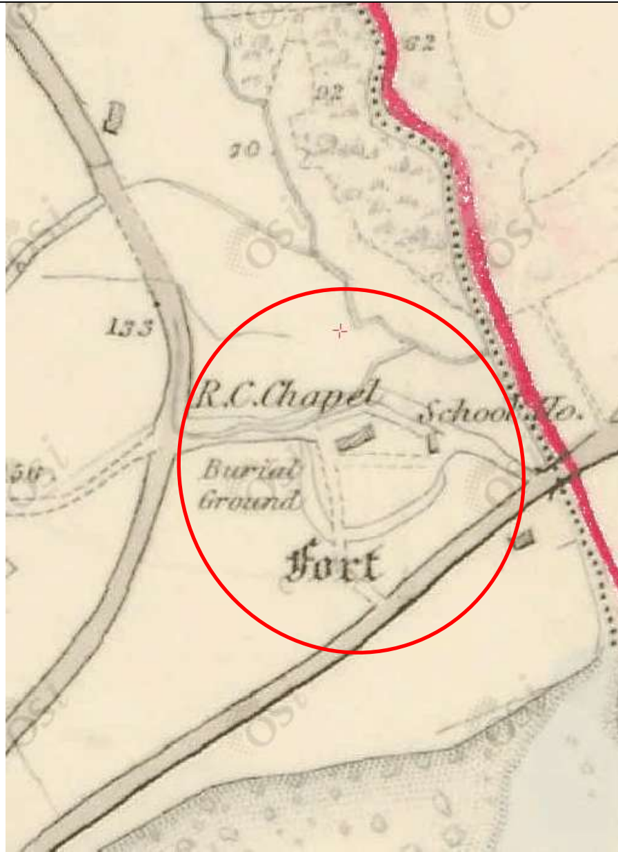
1 st edition OS map c. 1830