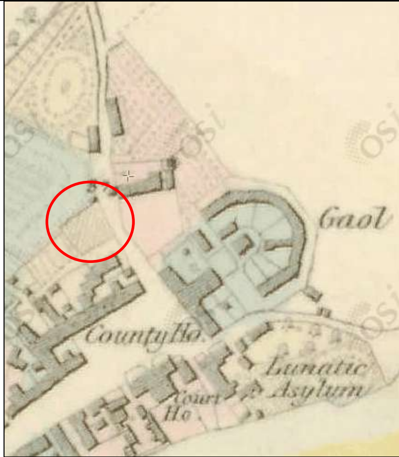
1 st edition OS map c. 1830 ( www.osi.ie )