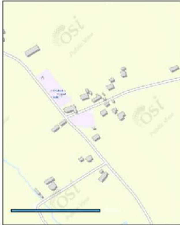
Present-day mapping extract ( www.osi.ie )