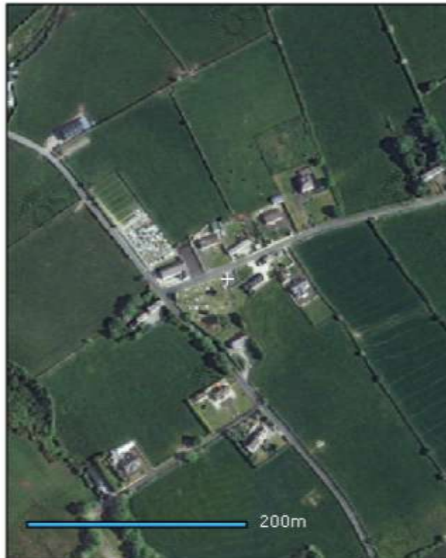
Present-day aerial view extract