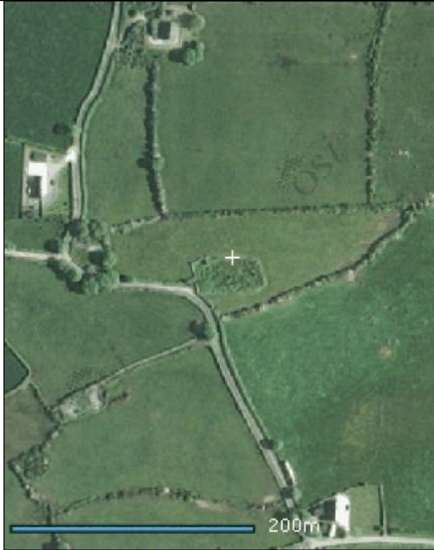
Location Map – close up