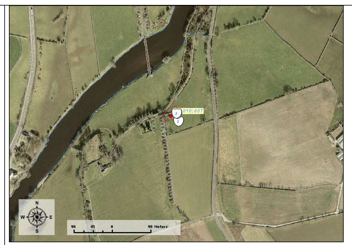
NIEA SMR map: TYR 005:002 is marked as no. 1 & 2