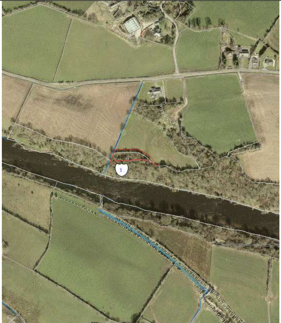
NIEA SMR map: TYR 005:002 is marked as no. 1