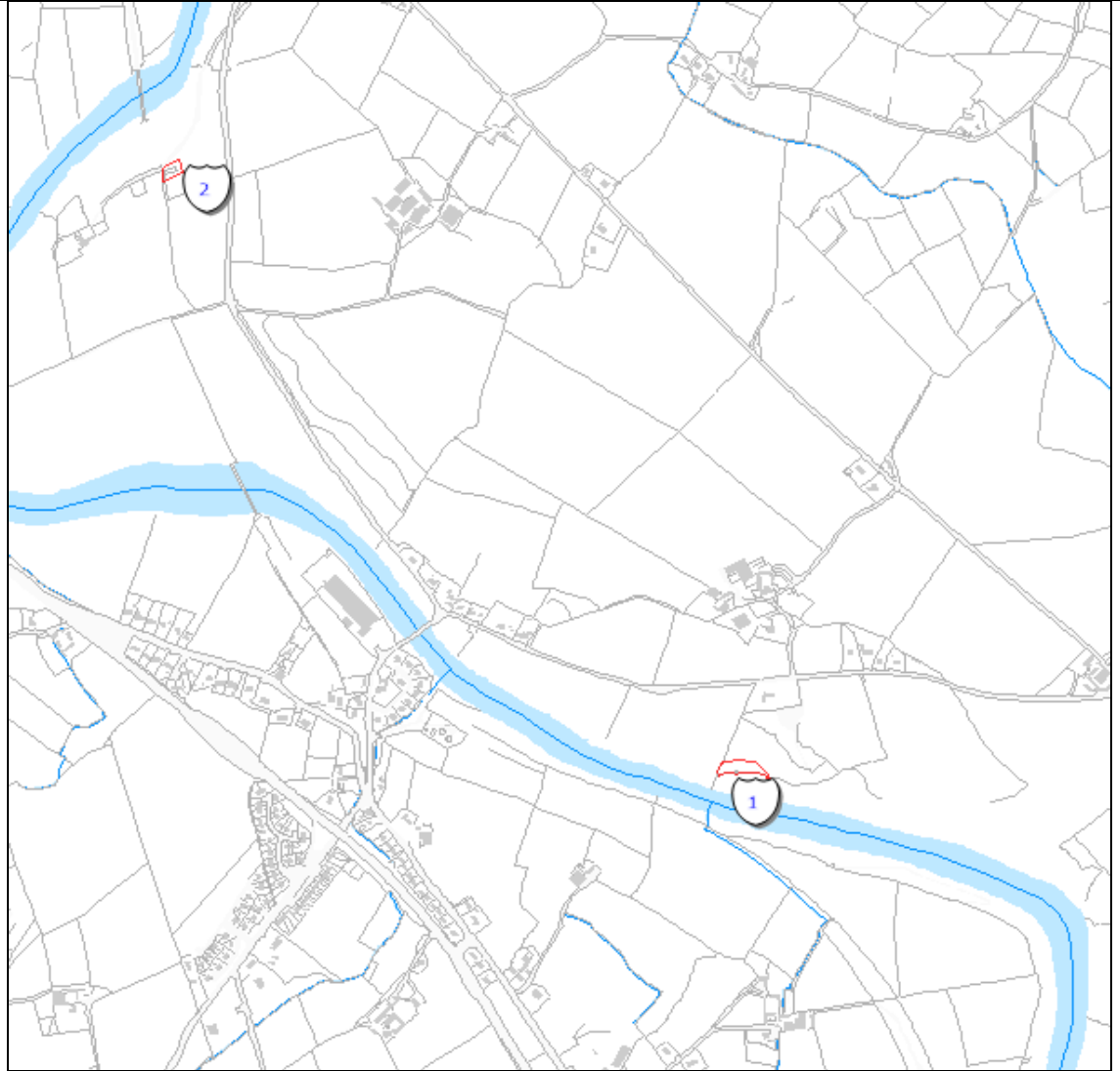
NIEA SMR map: TYR 010:006 is marked as no. 1, TYR010:007 is marked as no.2