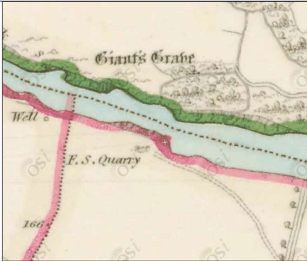
1st ed OS Map extract (1829-1842)( www.osi.ie )