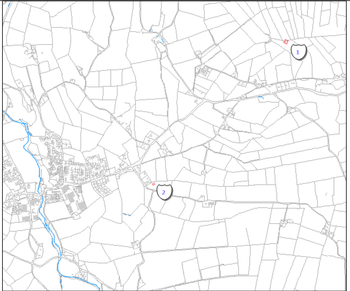
NIEA SMR map: TYR 002:007 is marked as no. 1, TYR005:002 is marked as no.2