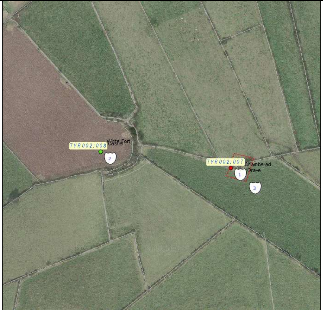
NIEA SMR map: TYR 002:007 is marked as no. 1&3, TYR 002:008 is marked as no. 2