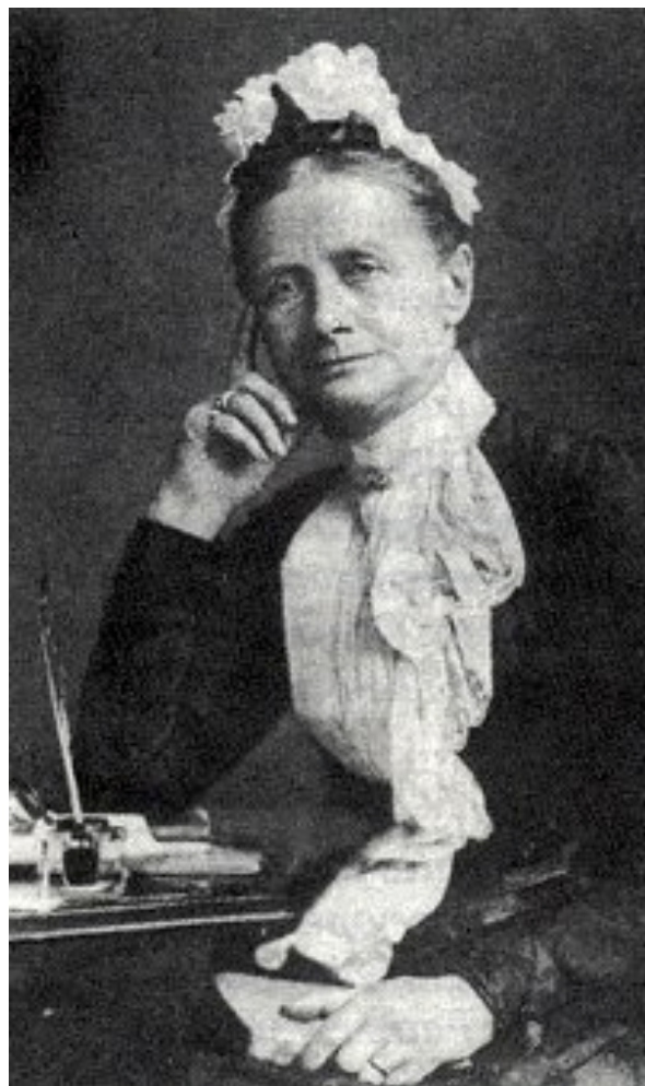
Cecil Frances Alexander (1818 -1895)