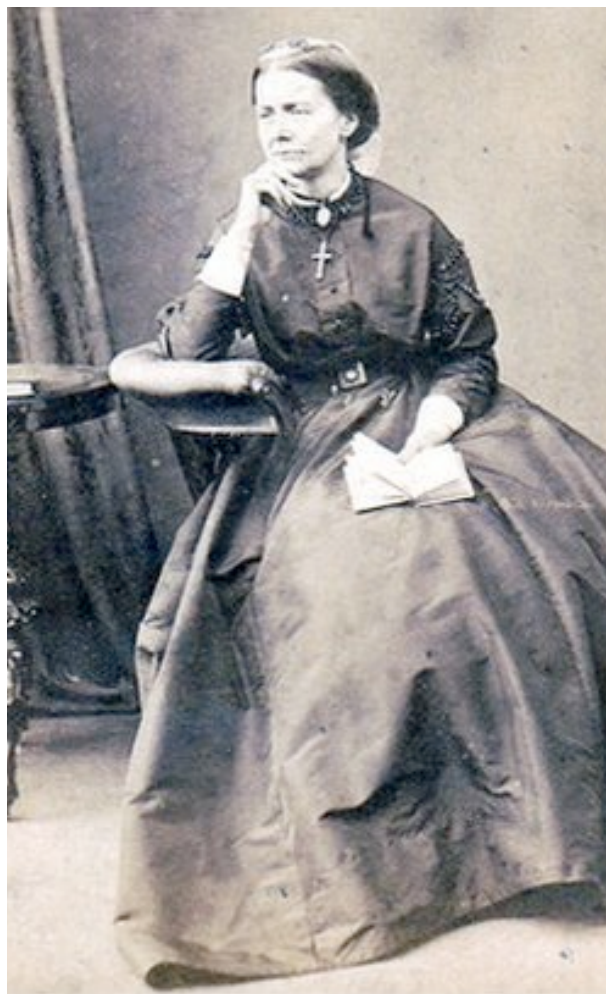
Cecil Frances Alexander (1818 -1895)