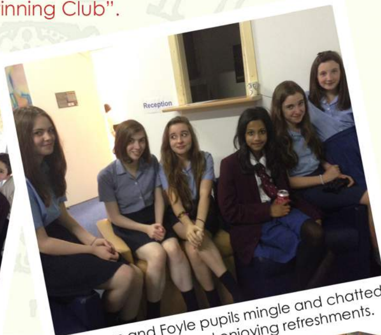
St Marys and Foyle pupils mingle and chatted whilst pitching and enjoying refreshments.