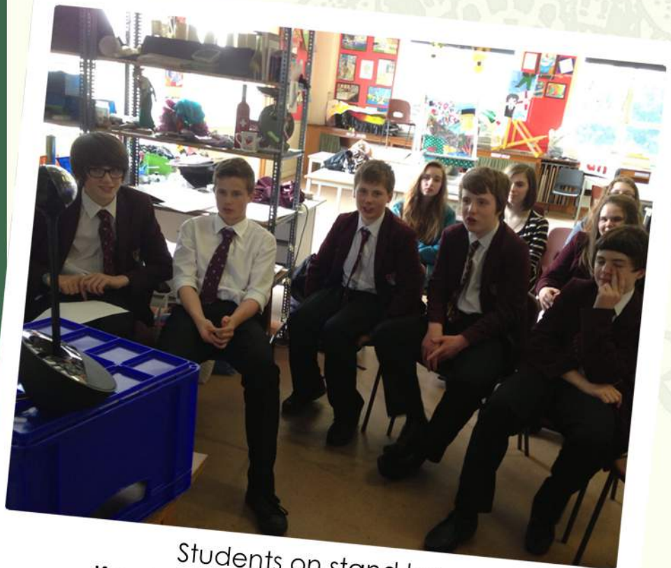
Students on stand by, if only the connection had worked.

Back in school an ICT teacher helped to try and connect us to the States. She established a good email contact with Londonderry High School in New Hampshire. The webcam was supplied through funding.