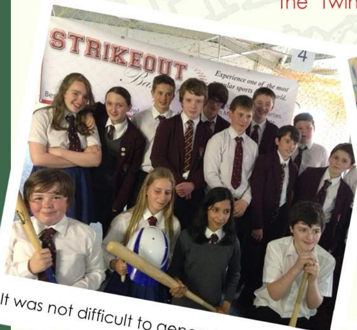
It was not difficult to generate enthusiasm.

This helped progress ice-breaker work done in the classroom after School in the 'Twinning Club'.