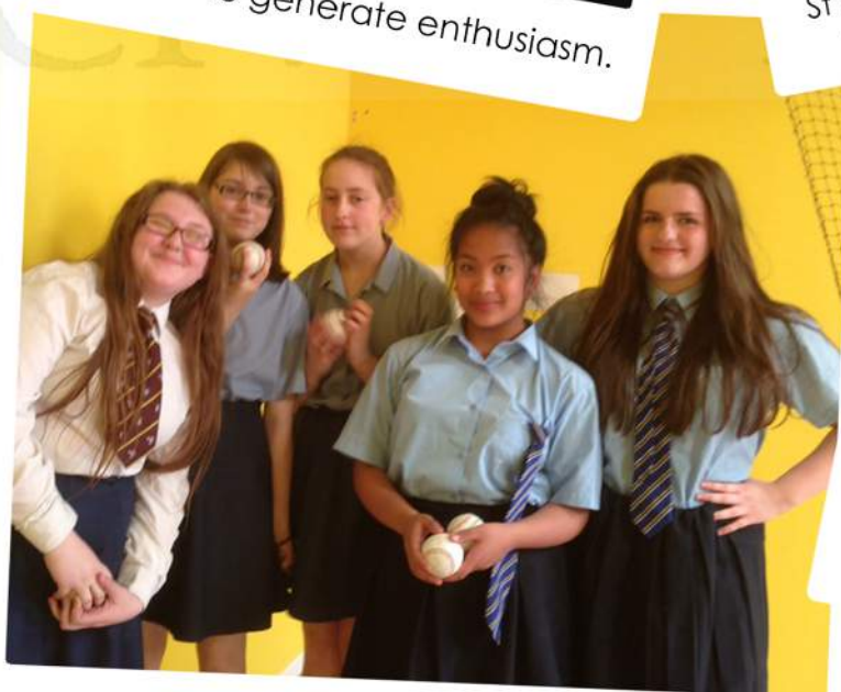
We actually visited the baseball park twice.