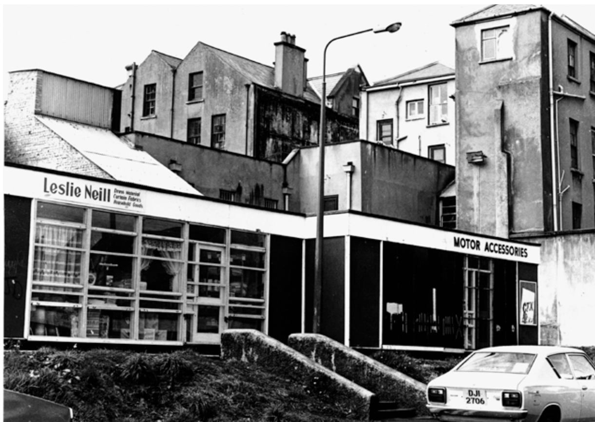
Richmond Street, circa 1973