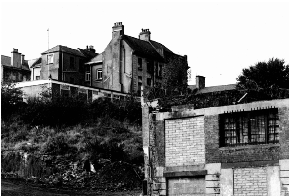
Richmond Street, circa 1973