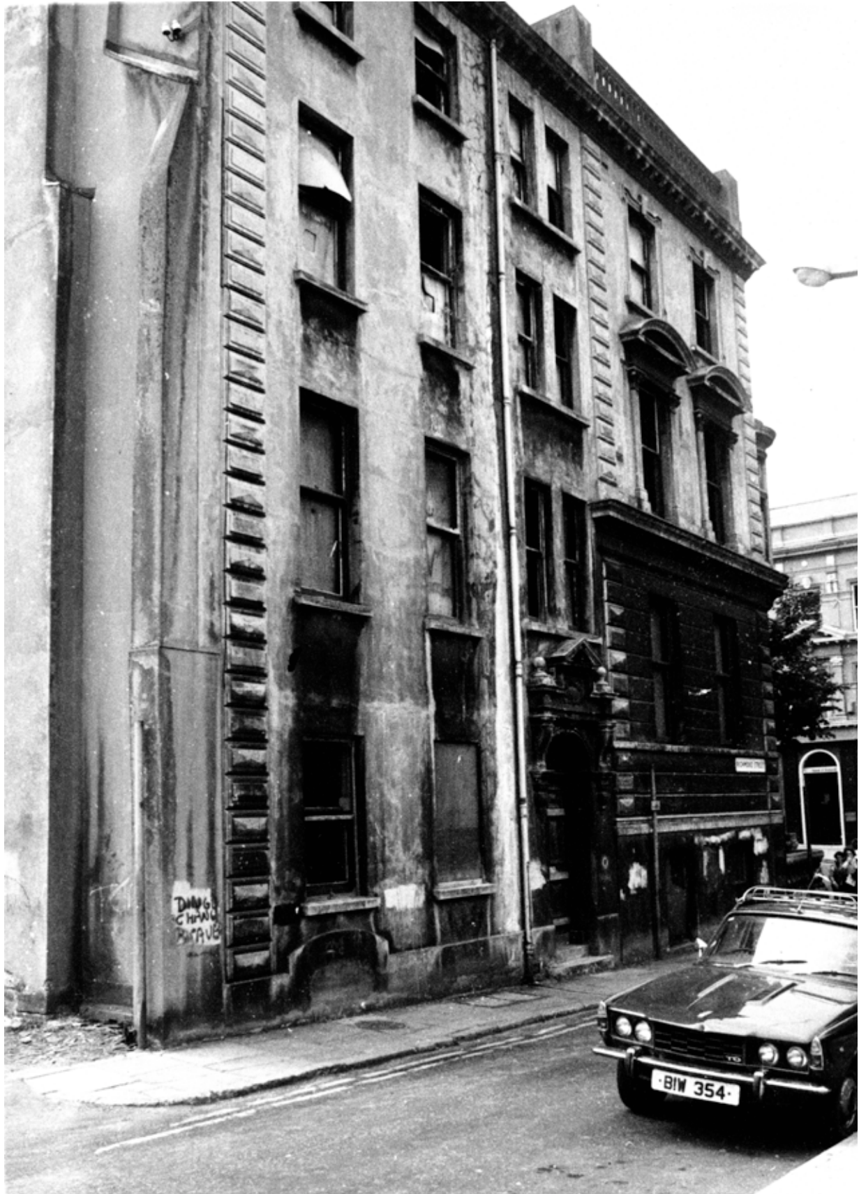
City Club, Richmond Street, circa 1973 (photo courtesy of DRD. Ornate doorway.