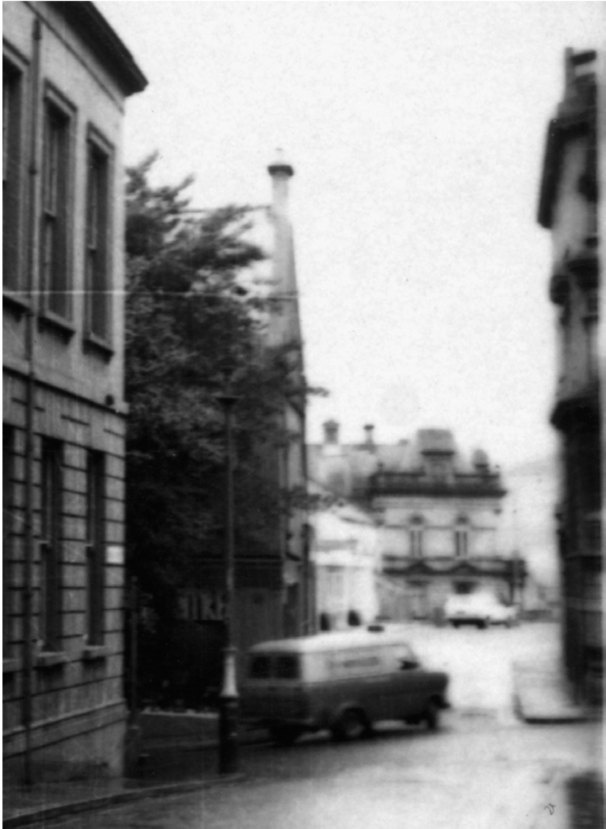
Richmond Street, from Castle Street, circa 1973