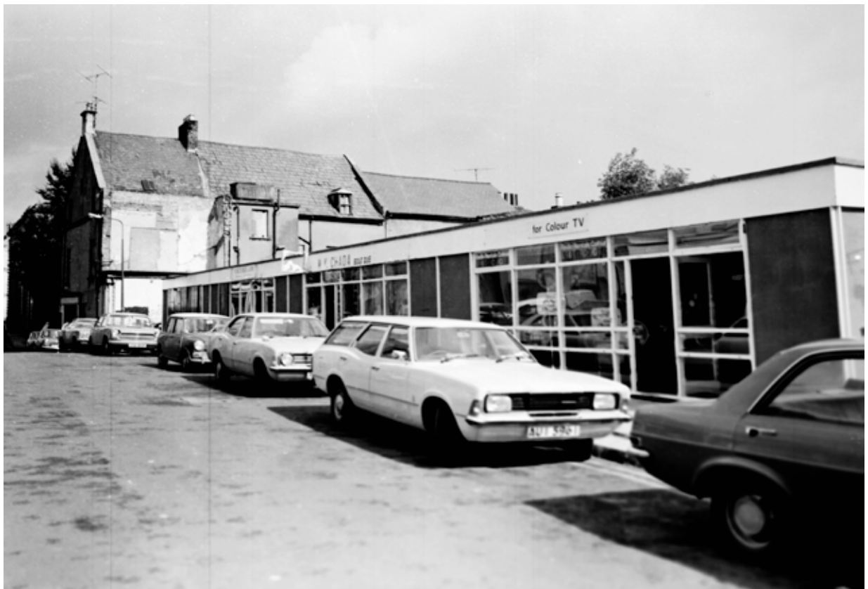
Richmond Street, circa 1973