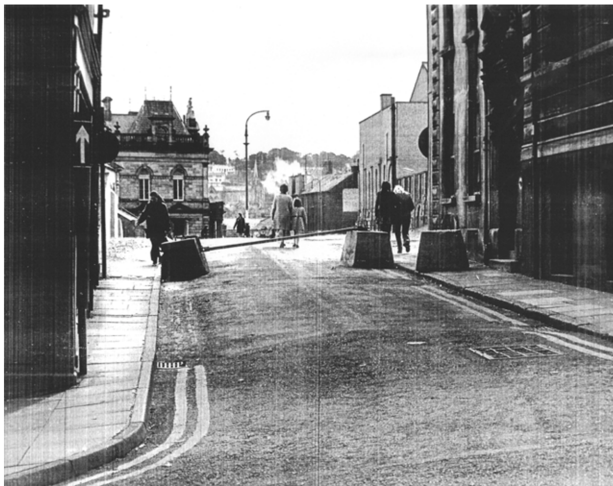
Richmond Street, circa 1973