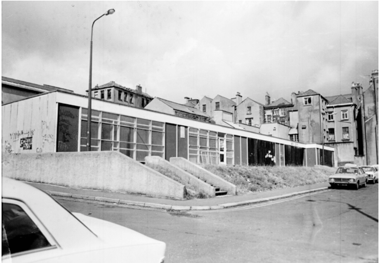
Richmond Street, circa 1973