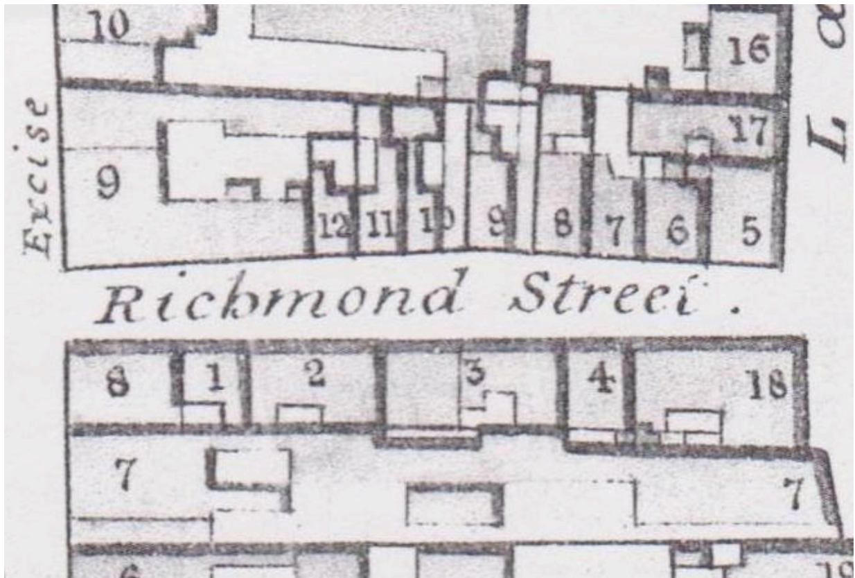
Richmond Street, Valuation Map, 1834. Shipquay St on left, Rosemary Lane (now Linenhall St) on right