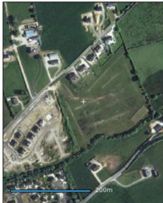
Present-day aerial view extract