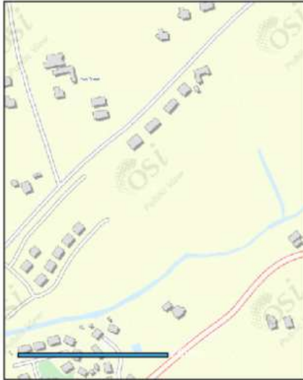
Present-day mapping extract ( www.osi.ie )