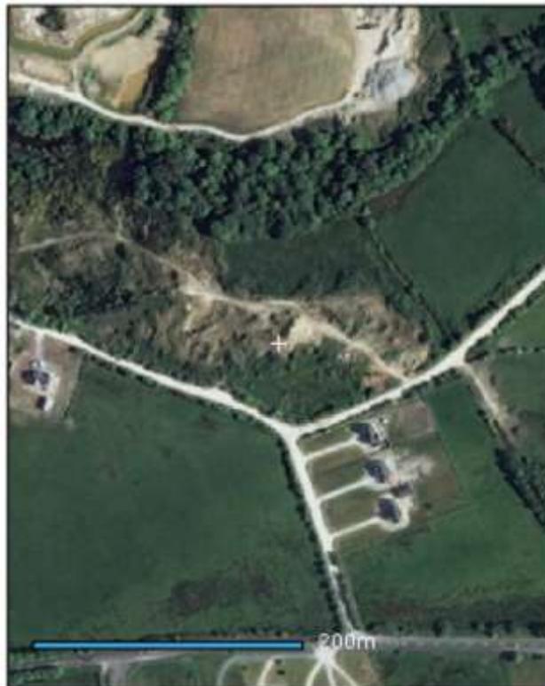
Present-day aerial view extract