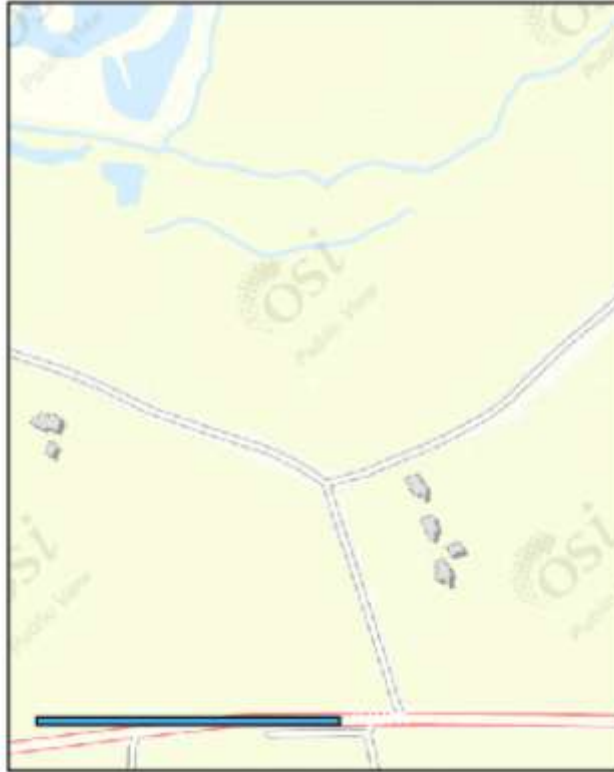
Present-day mapping extract ( www.osi.ie )