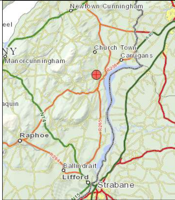
Location Map ( www.archaeology.ie )