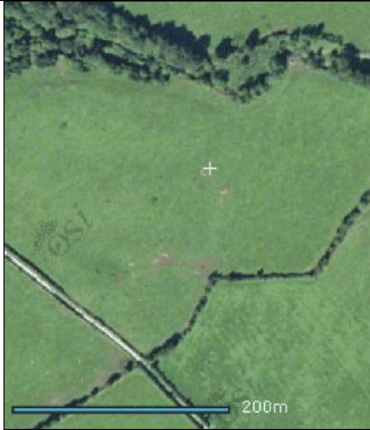
Location Map – close up ( www.archaeology.ie )