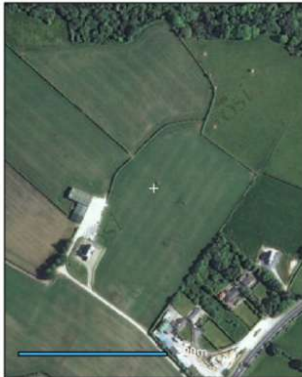
Present-day aerial view extract (www.osi.ie)