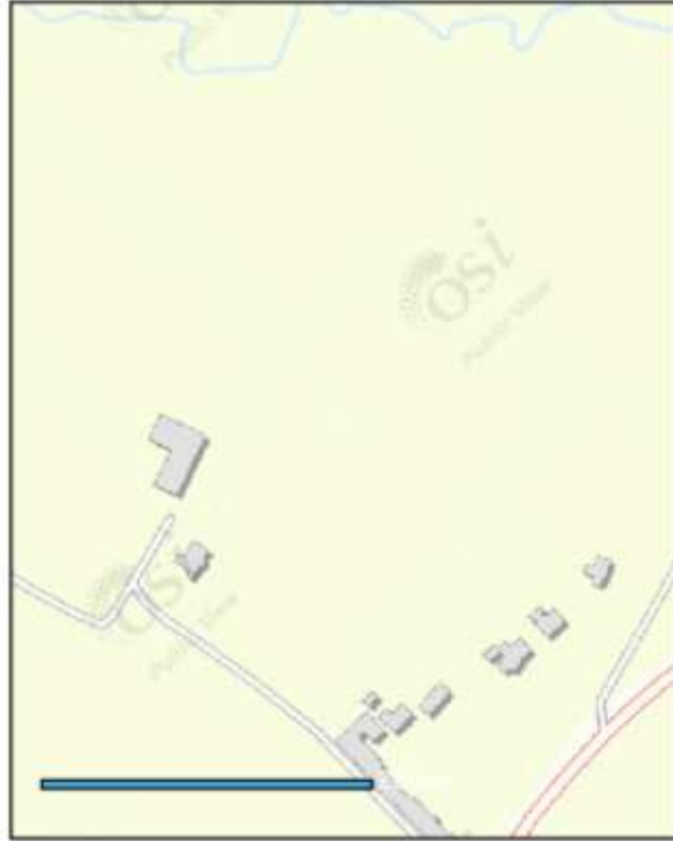
Present-day mapping extract