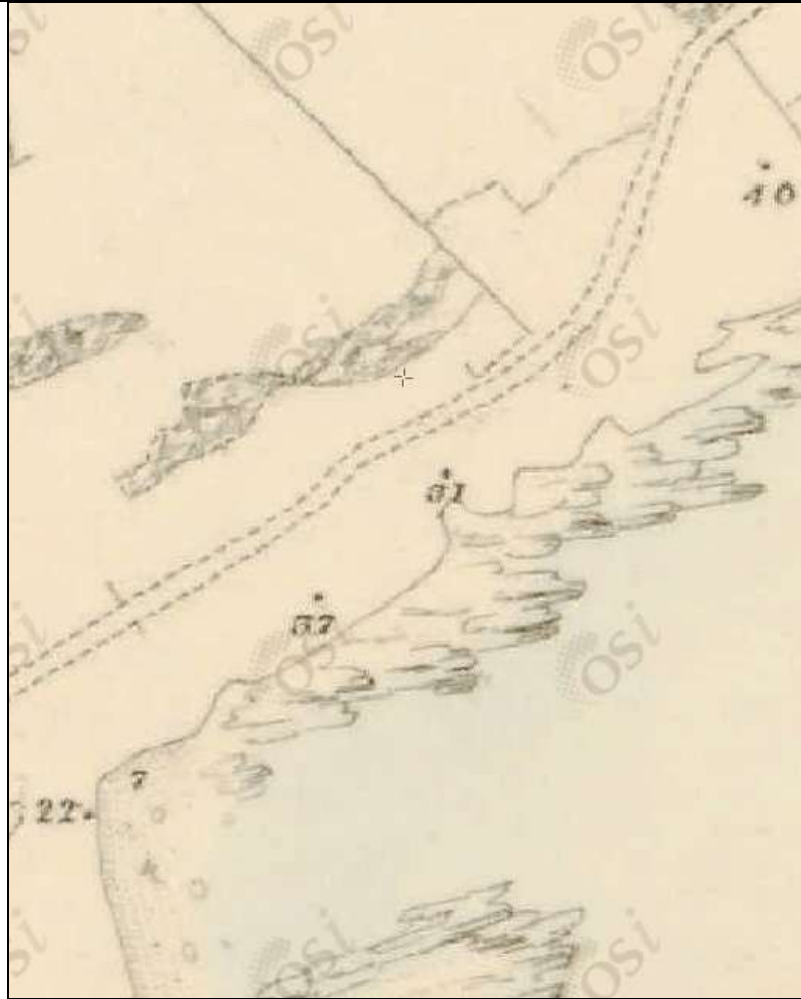
1 st edition OS map c. 1830 (www.osi.ie) Sweat house in red; Promontory fort in blue