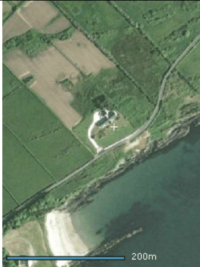
Location Map – close up