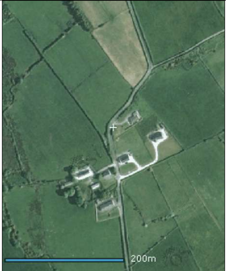
Location Map – close up (www.archaeology.ie)