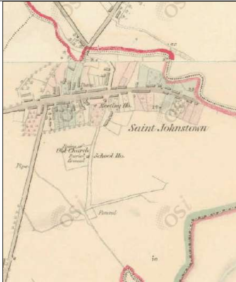
1 st edition OS map c. 1830 ( www.osi.ie )