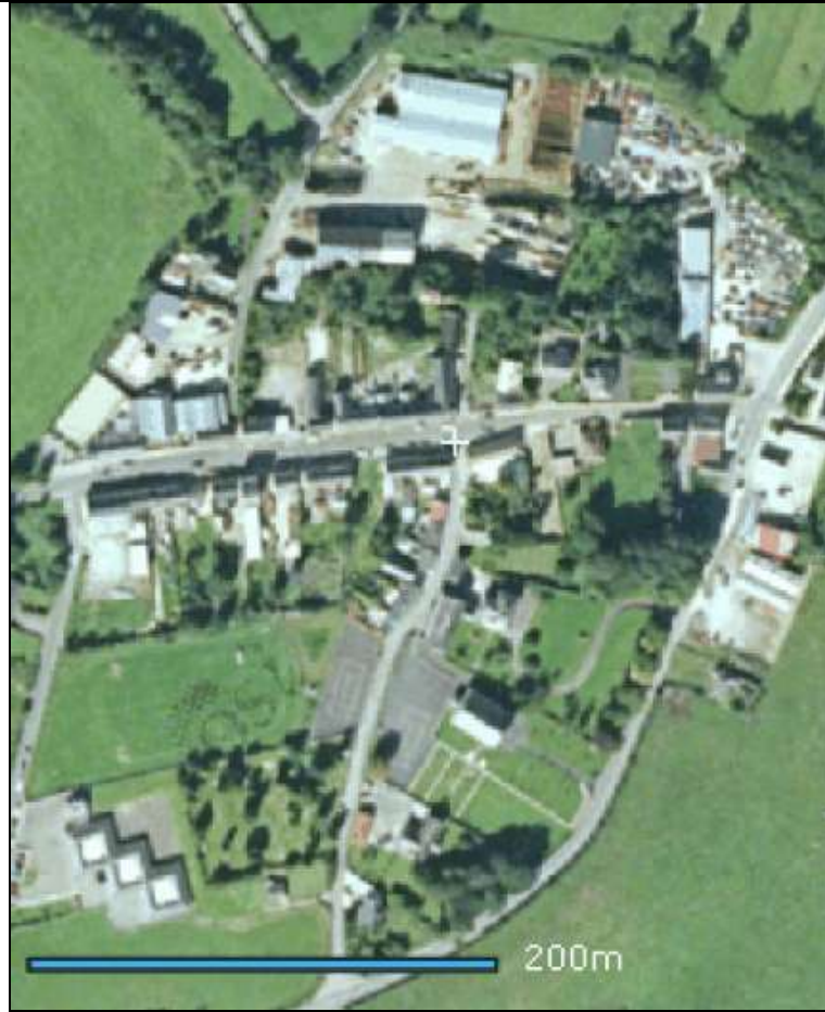
Location Map – close up ( www.archaeology.ie )