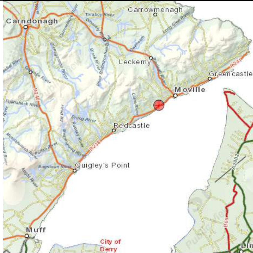
Location Map ( www.archaeology.ie )