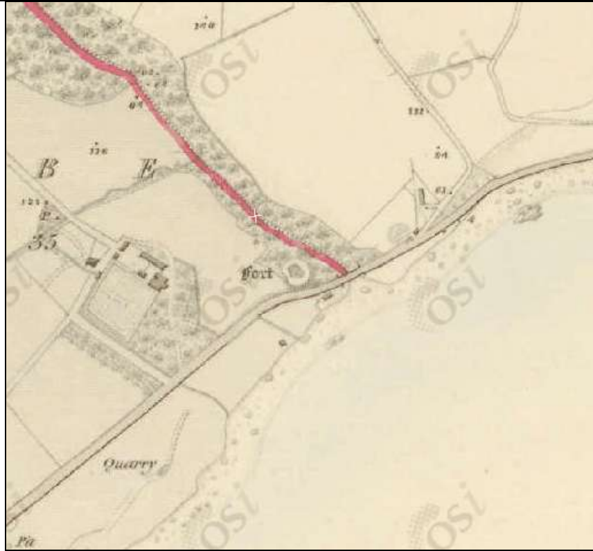
1 st edition OS map c. 1830