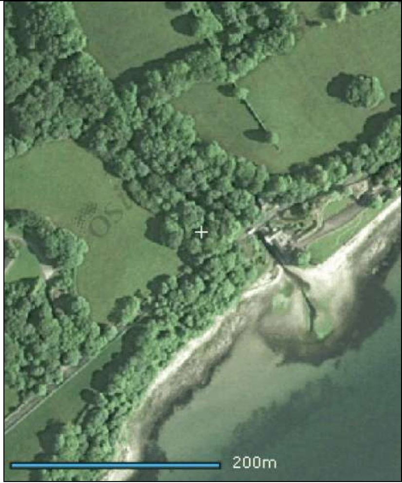
Location Map – close up