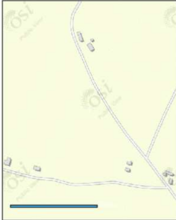
Present-day mapping extract