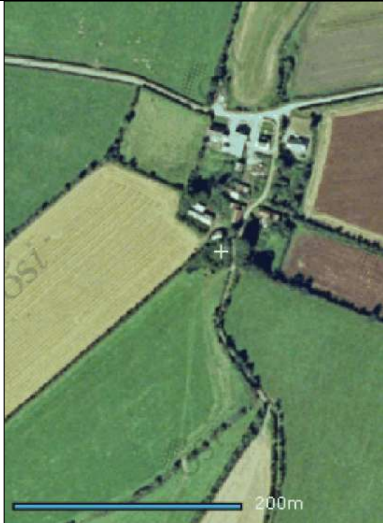
Location Map – close up (www.archaeology.ie)