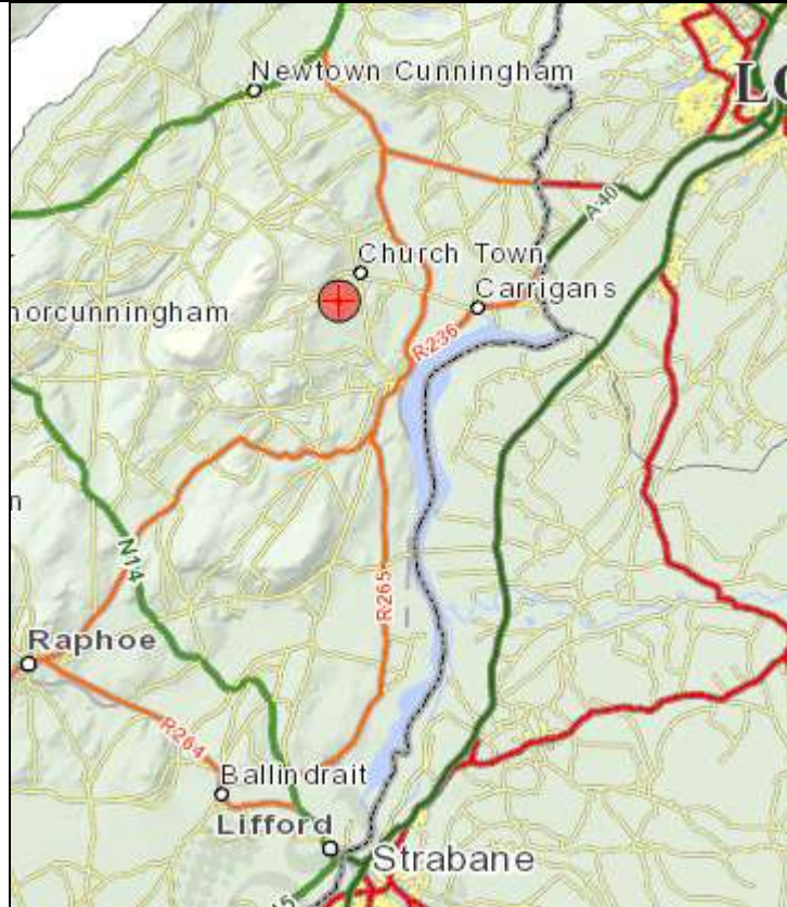
Location Map ( www.archaeology.ie )