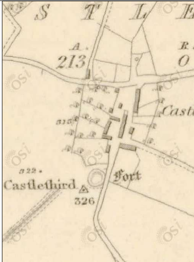
1 st edition OS map c. 1830