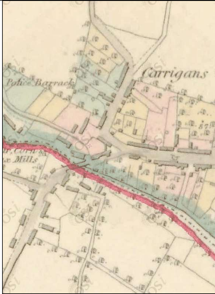
1 st edition OS map c. 1830 ( www.osi.ie )