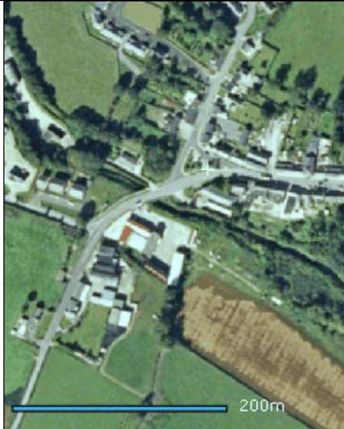
Location Map – close up