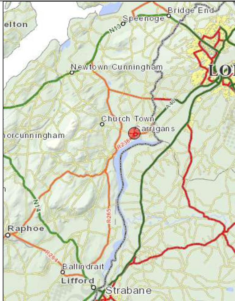
Location Map ( www.archaeology.ie )