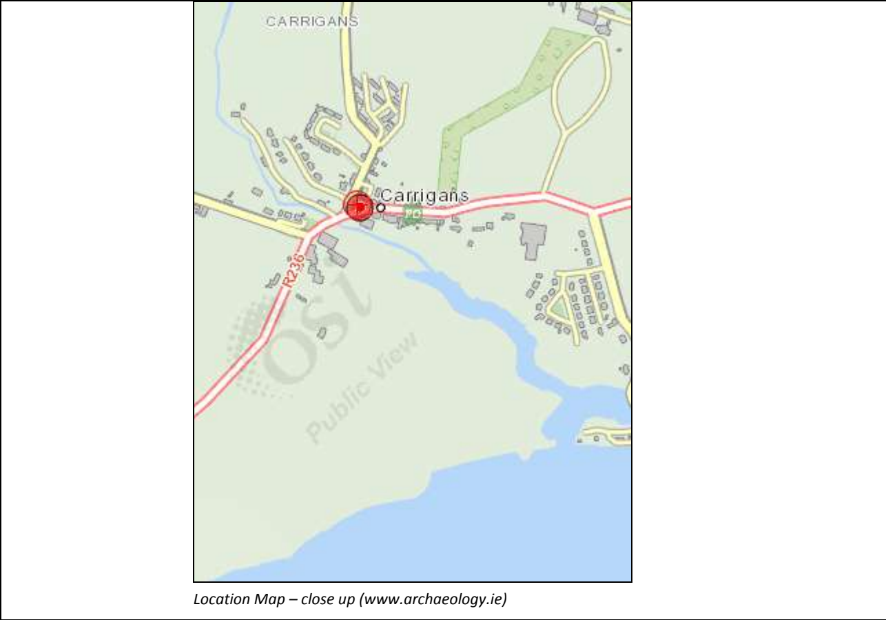
Location Map – close up ( www.archaeology.ie )