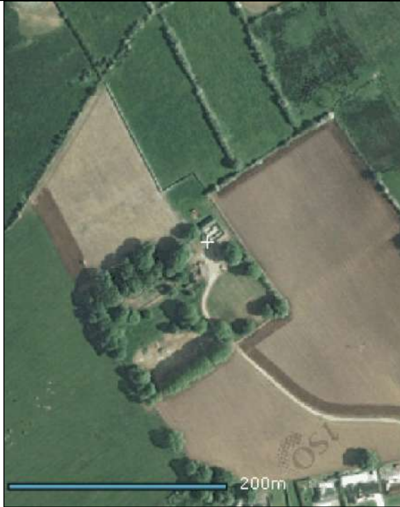
Location Map – close up