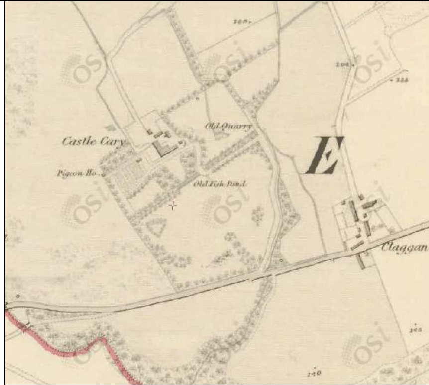
1 st edition OS map c. 1830 ( www.osi.ie )