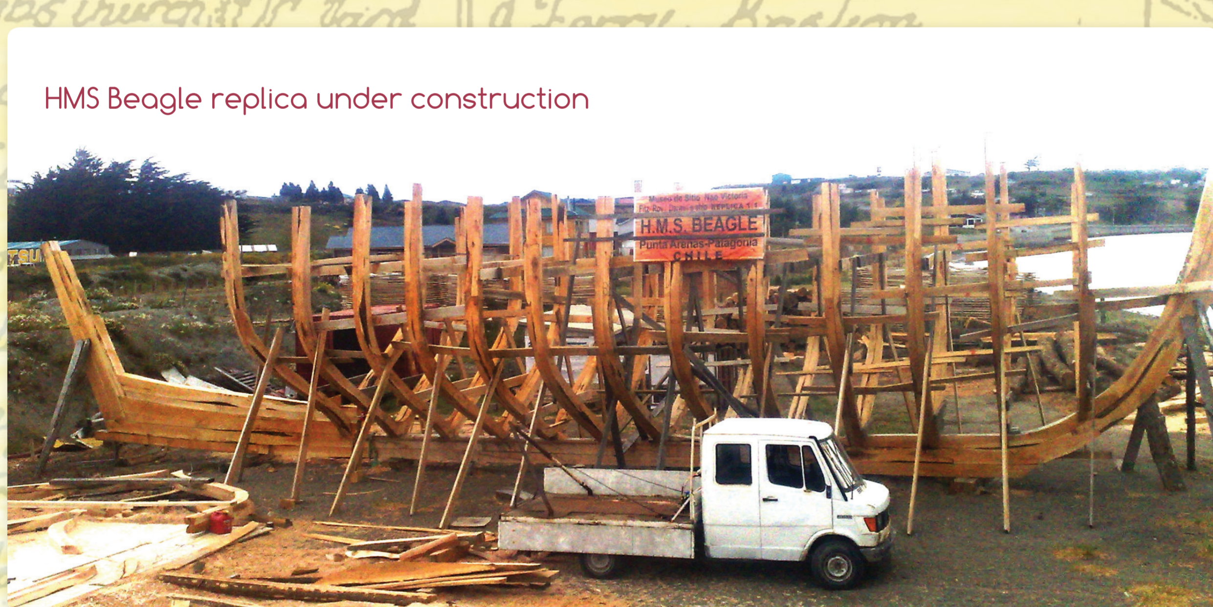
HMS Beagle replica under construction

The second Beagle Expedition 1831 – 1836 (returning to Tierra Del Fuego): again under the command of Fitzroy, with Charles Darwin accompanying: FitzRoy had found a need for expert advice on geology during the first voyage, and had resolved that if on a similar expedition, he would "endeavour to carry out a person qualified to examine the land; while the officers, and myself, would attend to hydrography." Command in that era could involve stress and loneliness, as shown by the suicide of Captain Stokes, and FitzRoy's own uncle Viscount Castlereagh had committed suicide under stress of overwork. His attempts to get a friend to accompany him fell through, and he asked his friend and superior, Captain Francis Beaufort, to seek a gentleman naturalist as a self-financing passenger who would give him company during the voyage. A sequence of inquiries led to Charles Darwin, a young gentleman on his way to becoming a rural clergyman, joining the voyage.