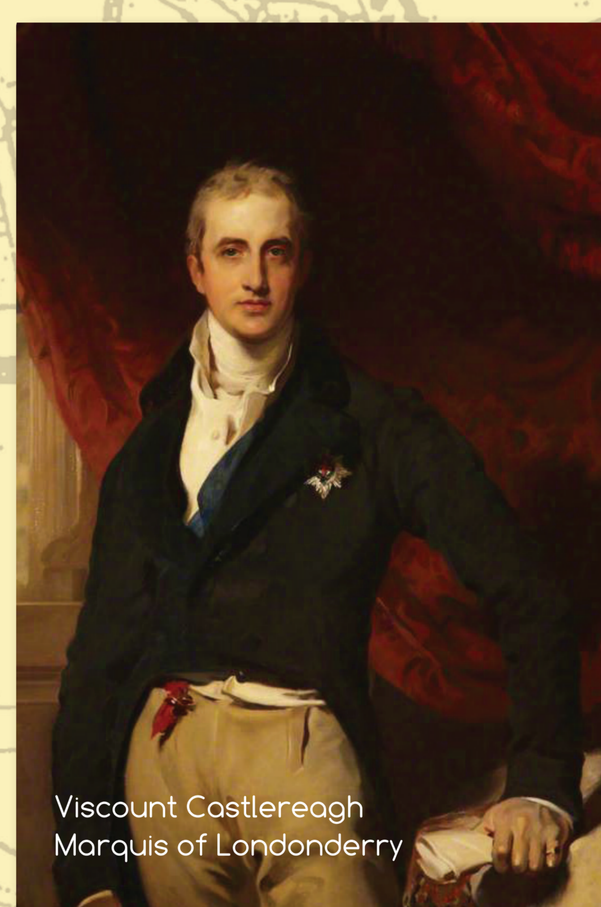
Viscount Castlereagh Marquis of Londonderry

The English Cherokee-class brig-sloop "Beagle" chartered the Tierra Del Fuego on two expeditions. In the first Beagle Expedition 1826 – 1830, the ship was under the ultimate command of Phillip Parker King – the namer of Cape of Londonderry, Western Australia. Part way through its journey, its direct commander changed from Stokes to Robert Fitzroy, whose uncle was Viscount Castlereagh (Marquis of Londonderry). Fitzroy surveyed the Beagle Channel and then presumably also Londonderry Island.