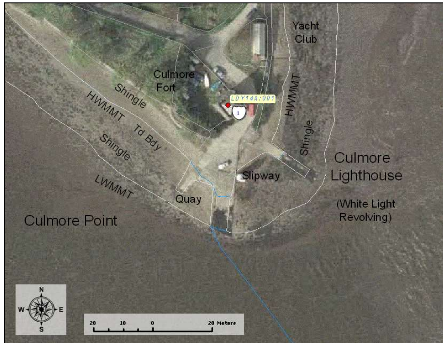
Extract from NIEA SMR MapViewer of the site