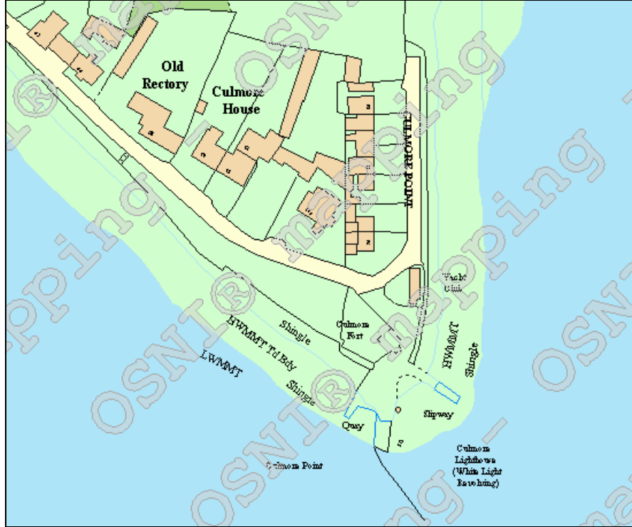
Present-day mapping extract ( www.osni.gov.uk )