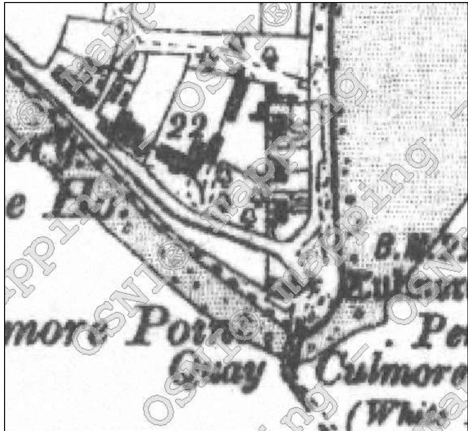
3 rd ed 6-inch OS Map (1857-1932)