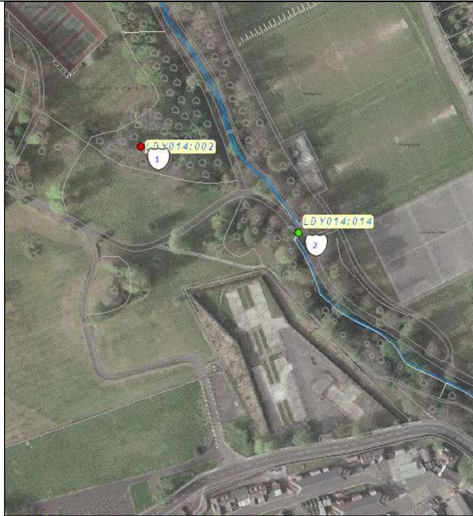
NIEA SMR map