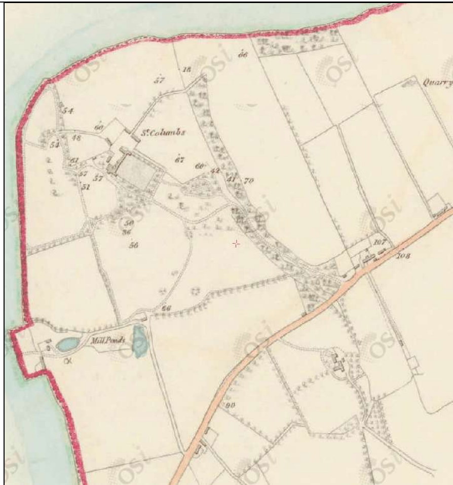
1st ed OS Map extract (1829-1842)