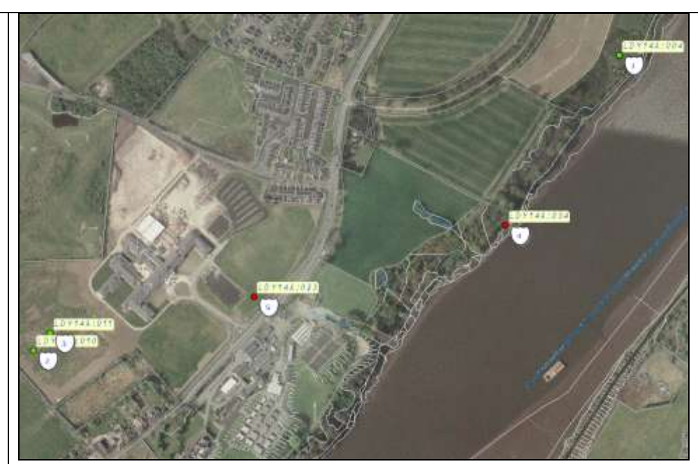
NIEA SMR map: LDY 014A:023 is Neolithic Settlement; LDY 014A:034 is an Antiaircraft Battery; LDY 014A:004 is an Enclosure and Flint scatter; LDY 014A:010 & LDY 014A:011 are Circular Enclosures (AP sites).