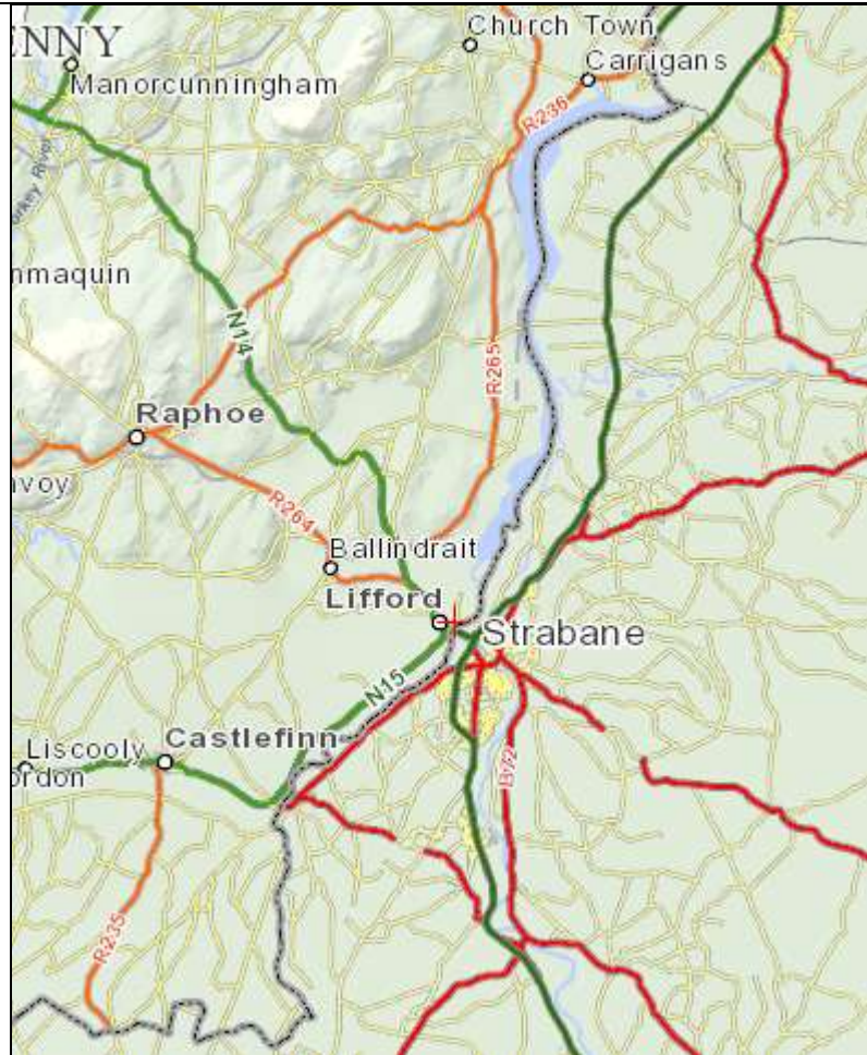
Location Map ( www.archaeology.ie )