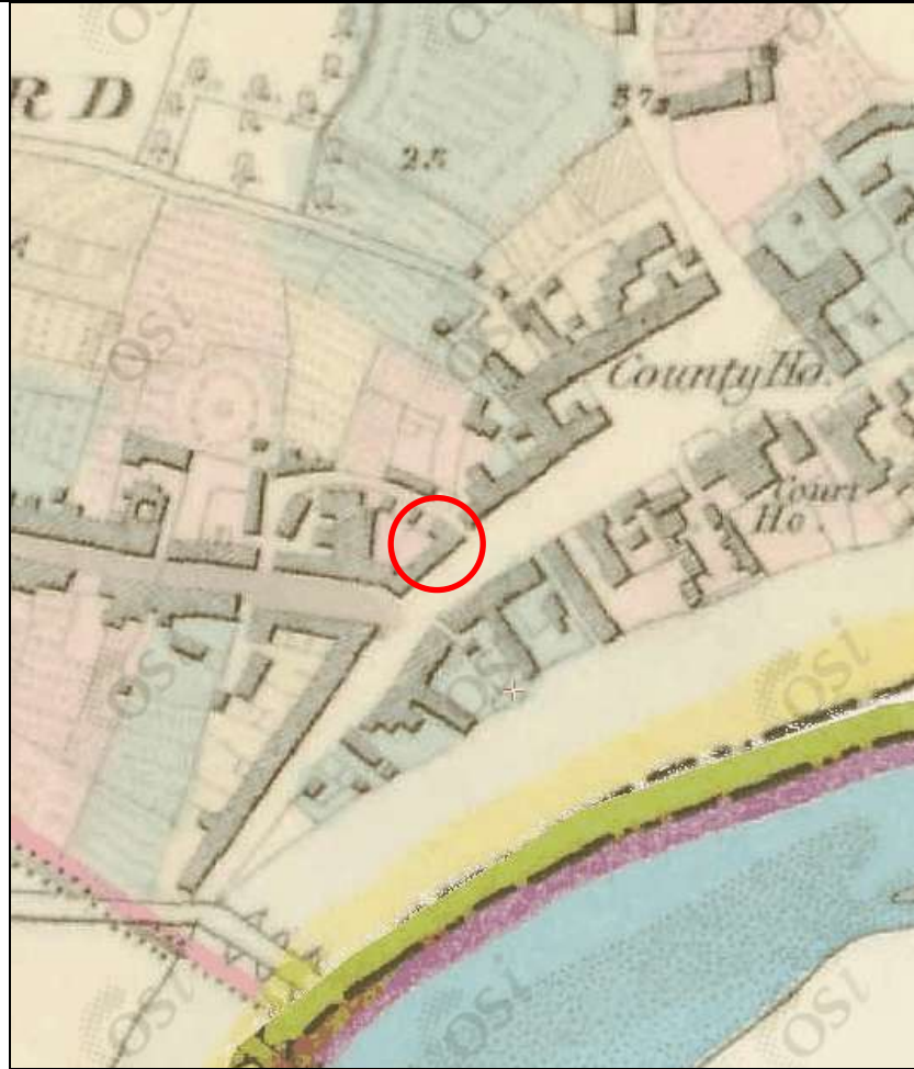
1 st edition OS map c. 1830