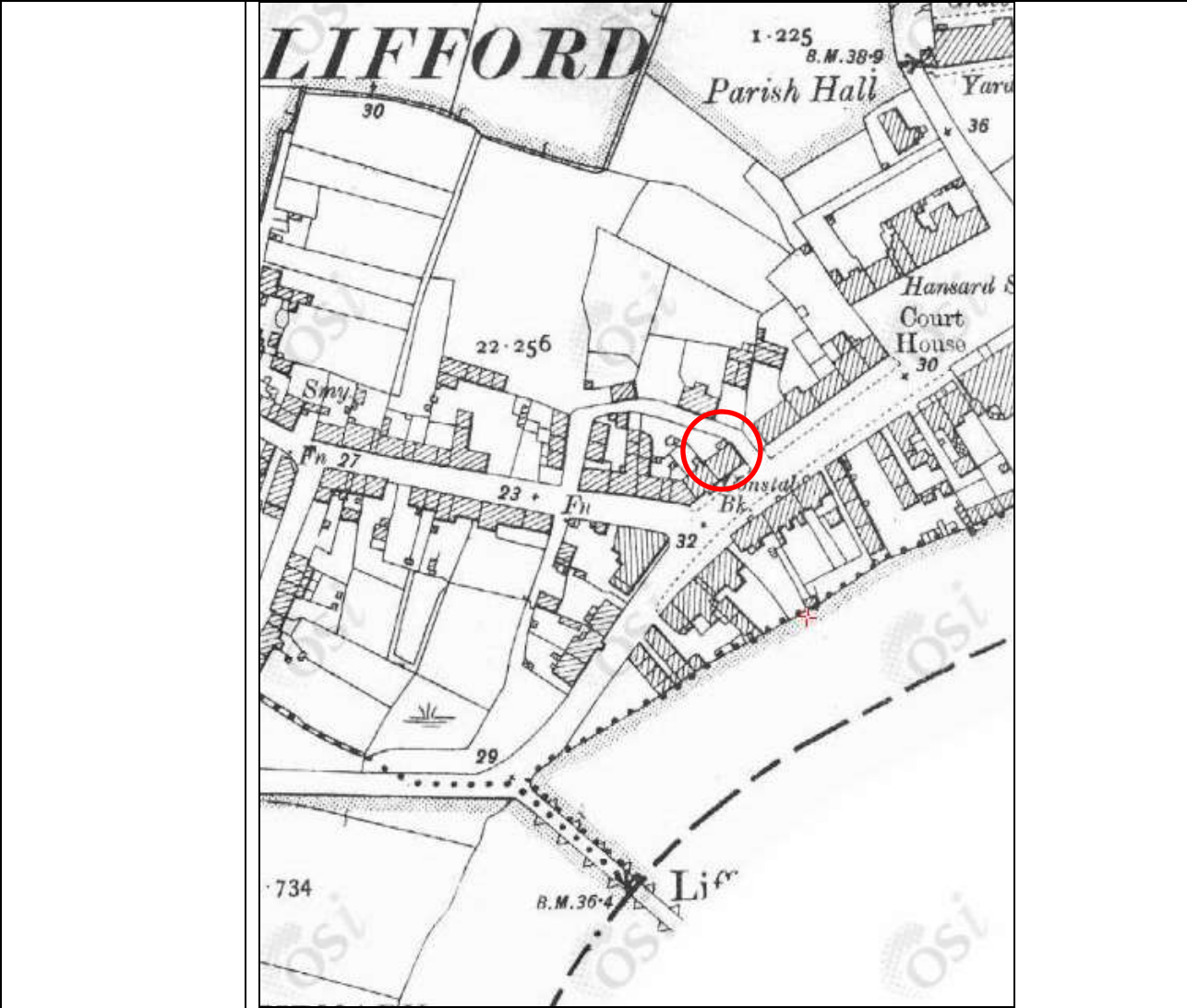
2 nd edition OS map c. 1905 ( www.osi.ie )