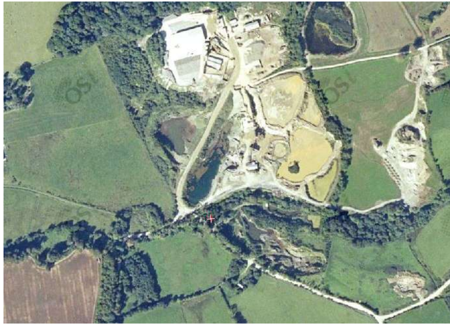
Extract from aerial mapping ( www.osi.ie )