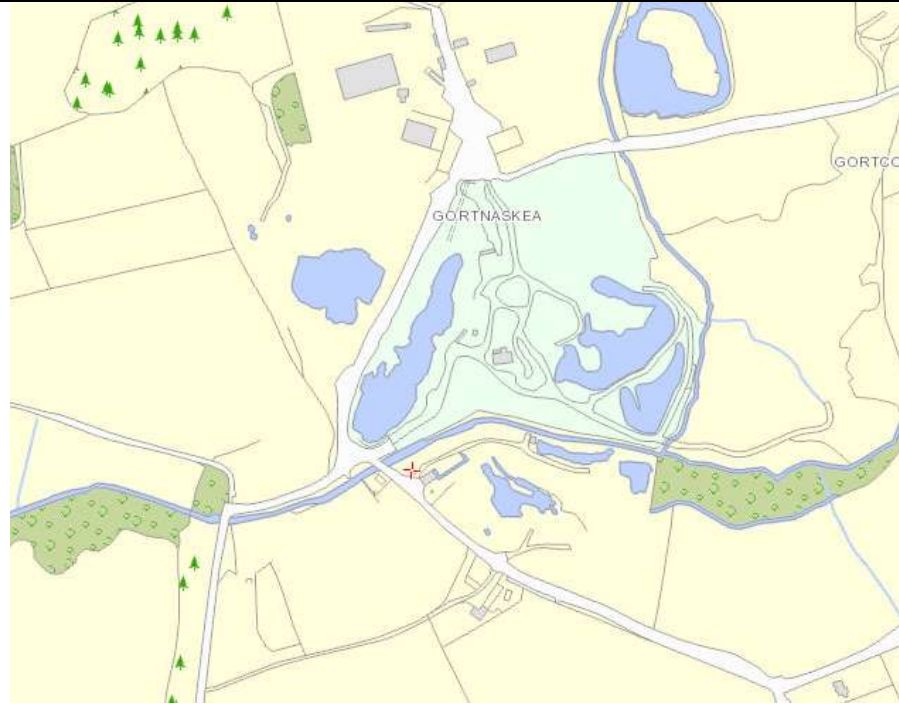
Present day mapping extract ( www.osi.ie )