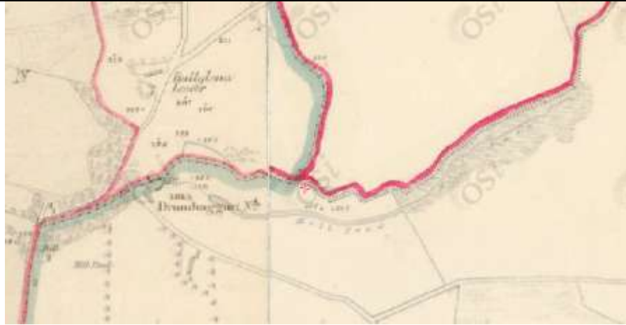
Extract from 1 st edition OS map (1820s-1840s)