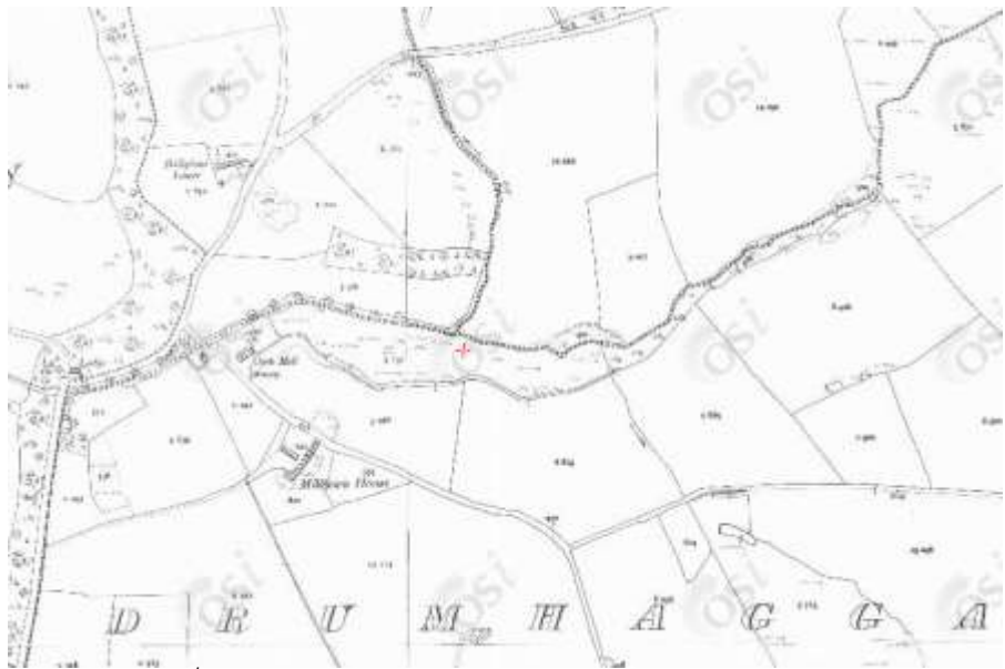
Extract from 2 nd edition OS map (1890s - 1900s)