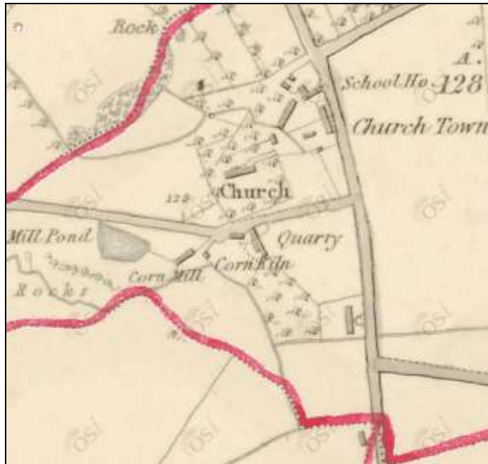
1 st edition OS map c. 1830 ( www.osi.ie )