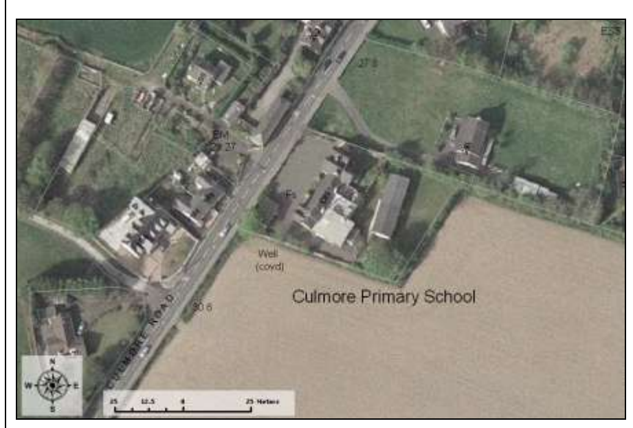
Extract from NIEA SMR MapViewer of the site