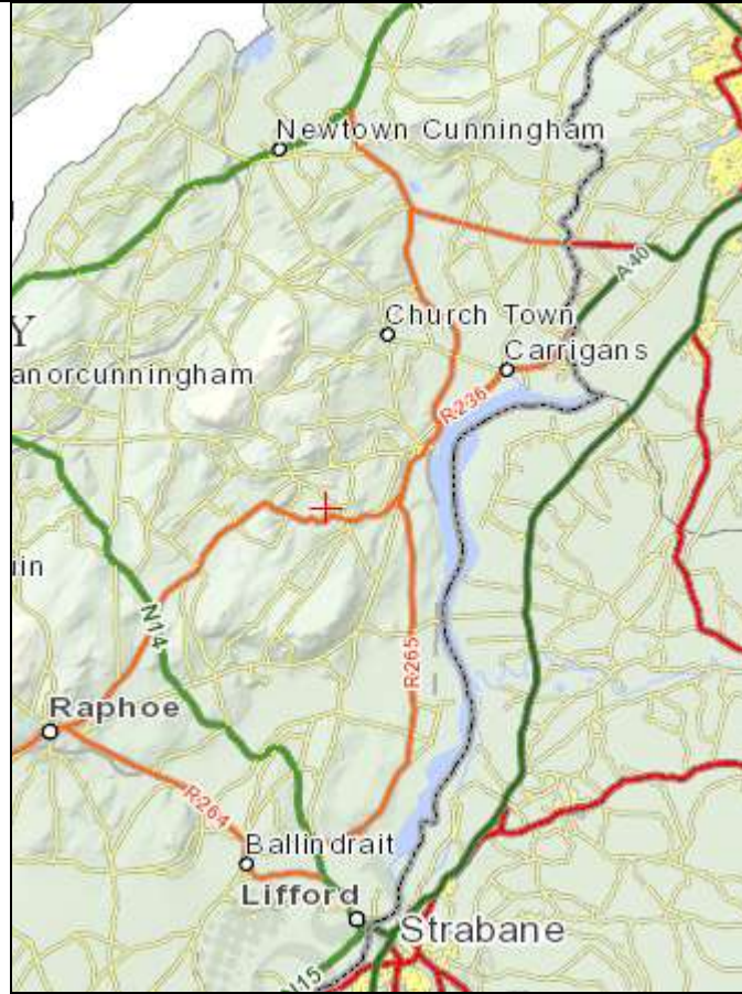
Location Map ( www.archaeology.ie )