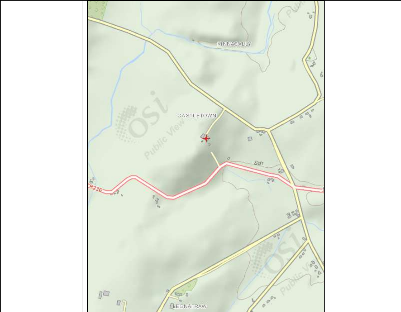
Location Map – close up