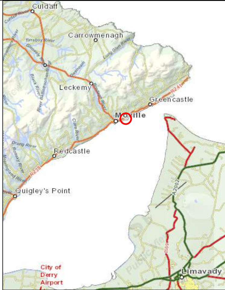
Location Map ( www.archaeology.ie )