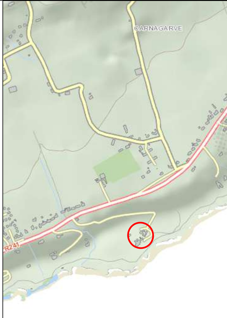
Location Map – close up ( www.archaeology.ie )