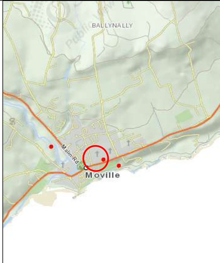
Location Map – close up