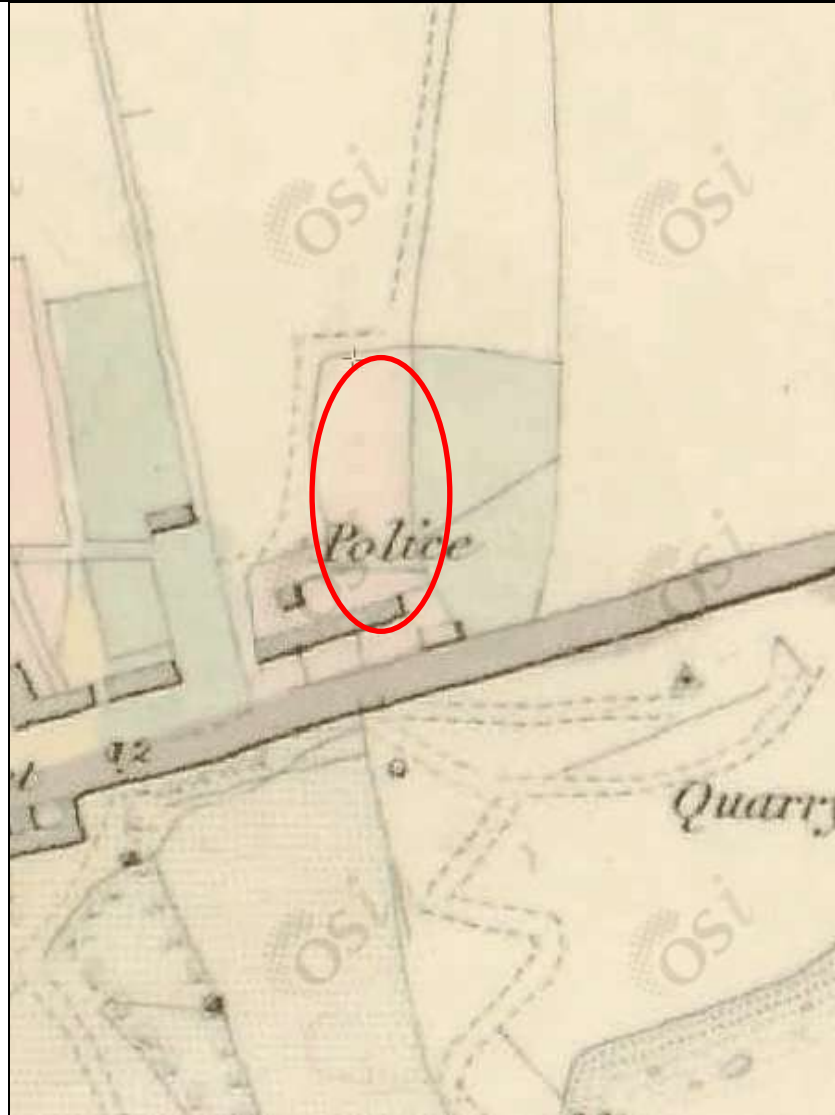
1 st edition OS map c. 1830 ( www.osi.ie )