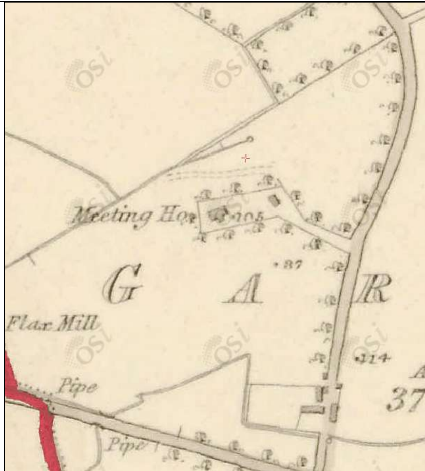
1 st edition OS map c. 1830 ( www.osi.ie )