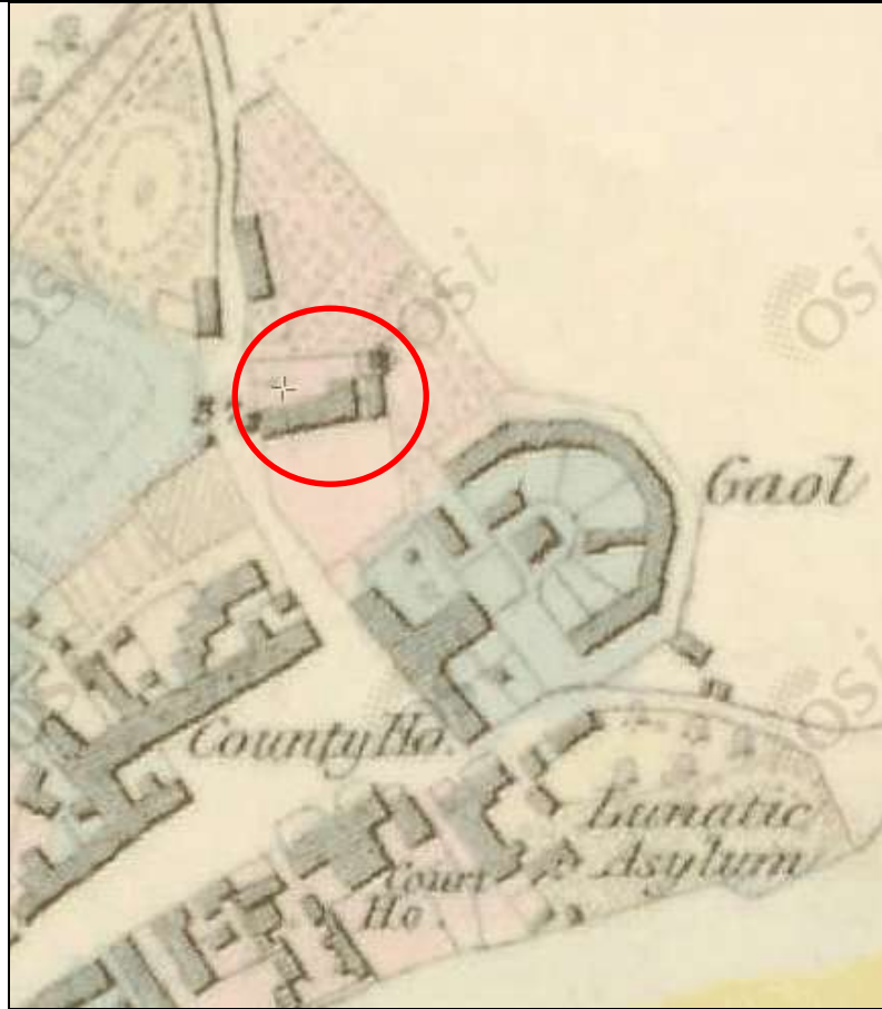
1 st edition OS map c. 1830 ( www.osi.ie )