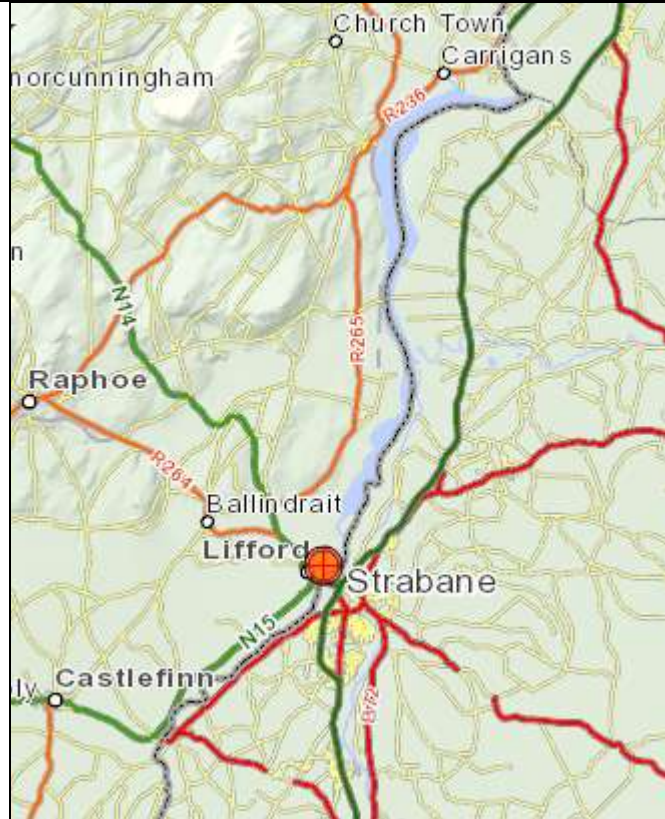
Location Map ( www.archaeology.ie )