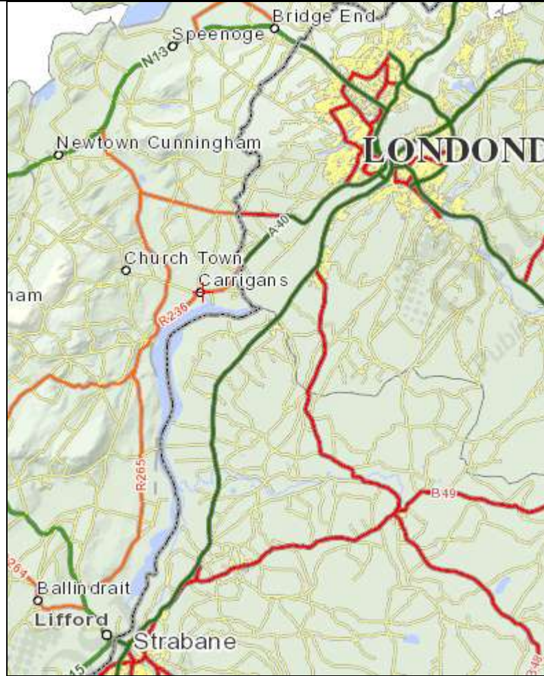
Location Map ( www.archaeology.ie )