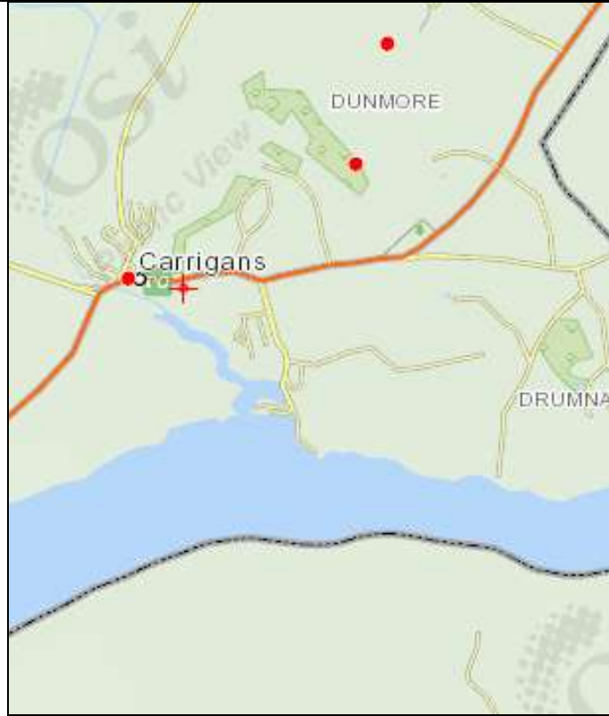
Location Map – close up