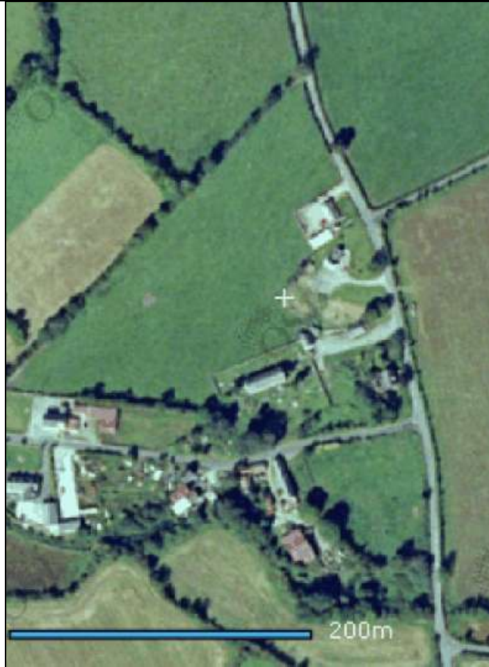
Location Map – close up