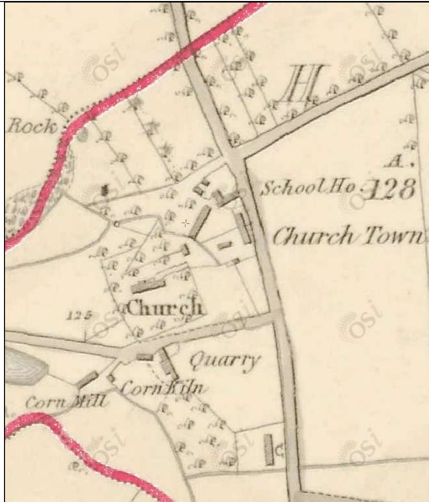
1 st edition OS map c. 1830