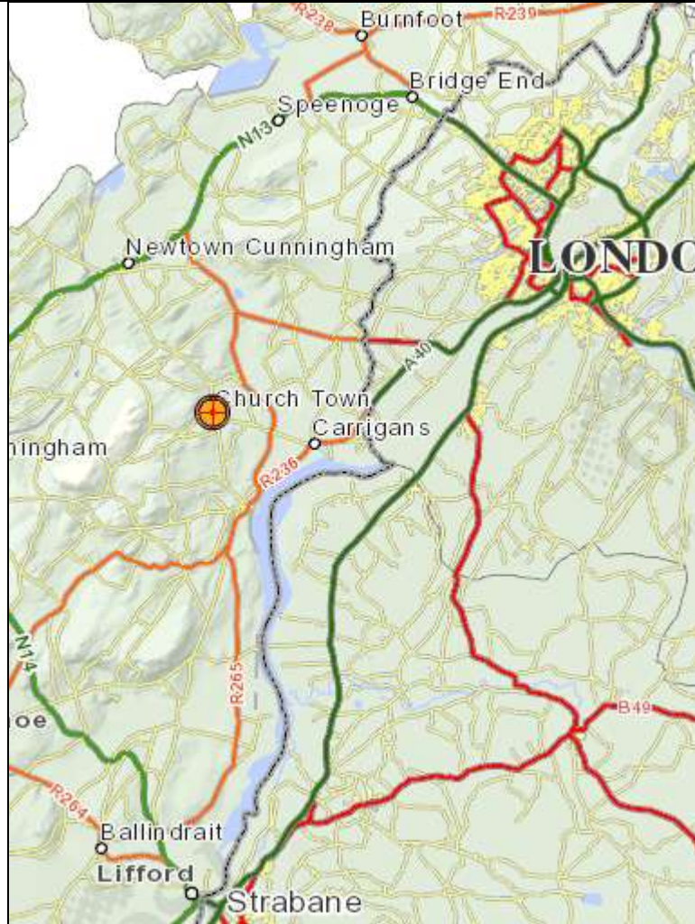
Location Map ( www.archaeology.ie )