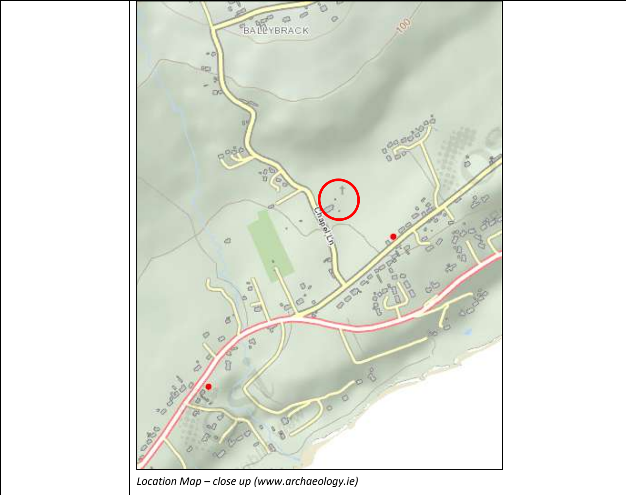
Location Map – close up ( www.archaeology.ie )