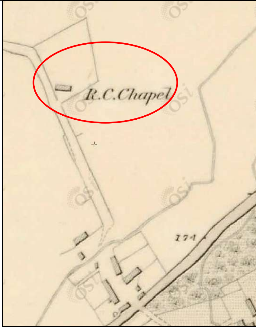
1 st edition OS map c. 1830 ( www.osi.ie )