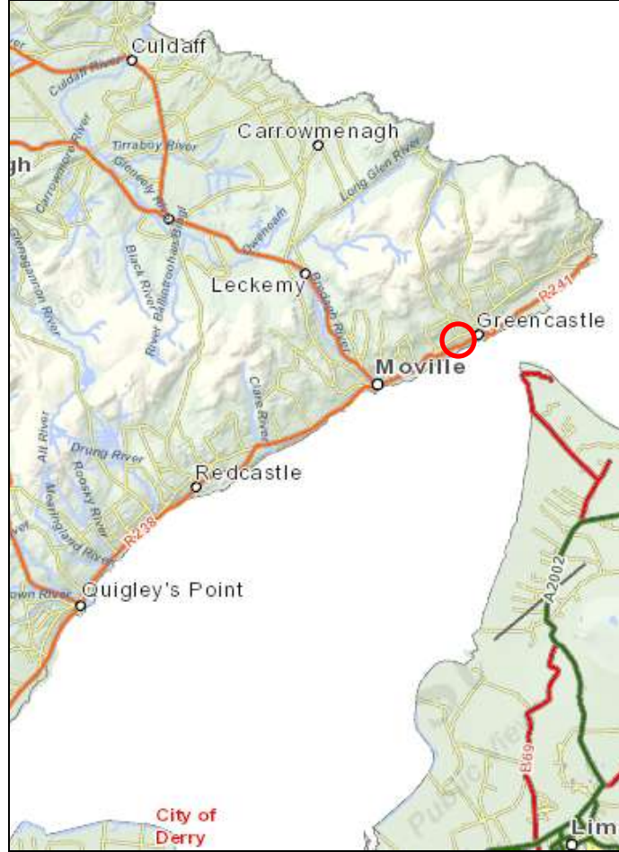
Location Map ( www.archaeology.ie )