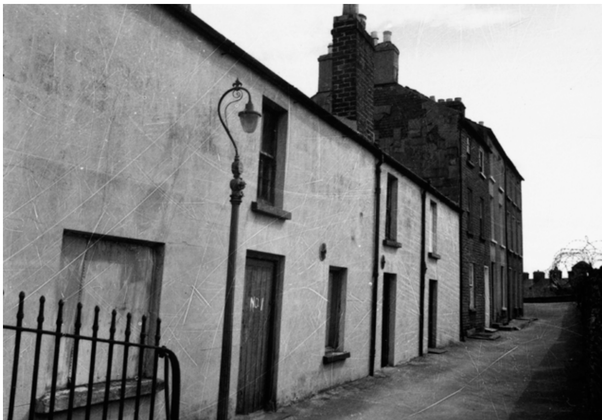
Apprentice Boys Reading Room, Church Wall, circa 1973