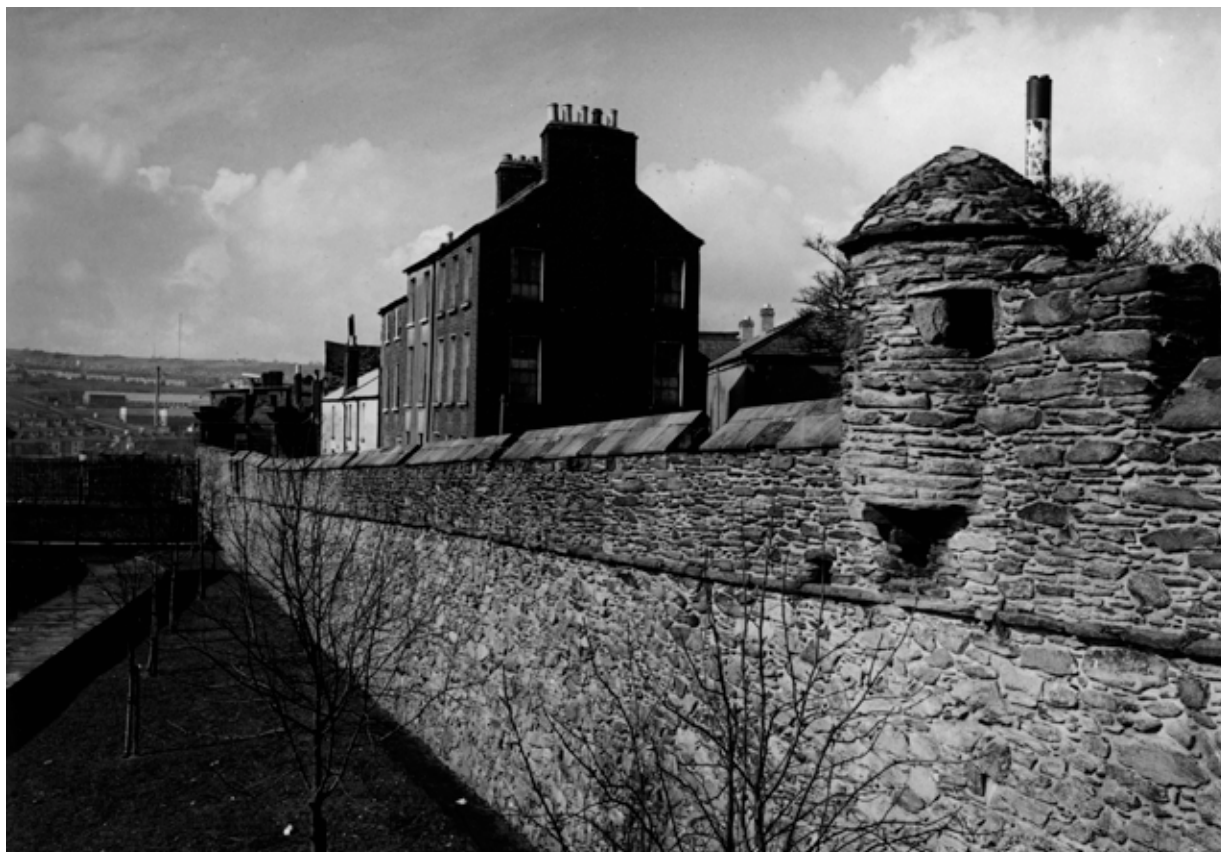
Church Wall from Church Bastion, circa 1973