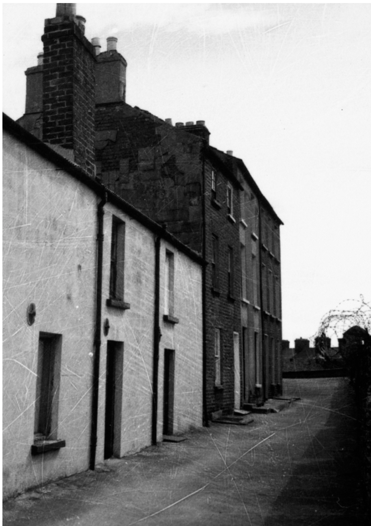
Church Wall, circa 1973