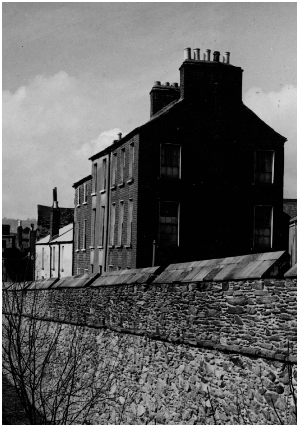
Church Wall, circa 1973